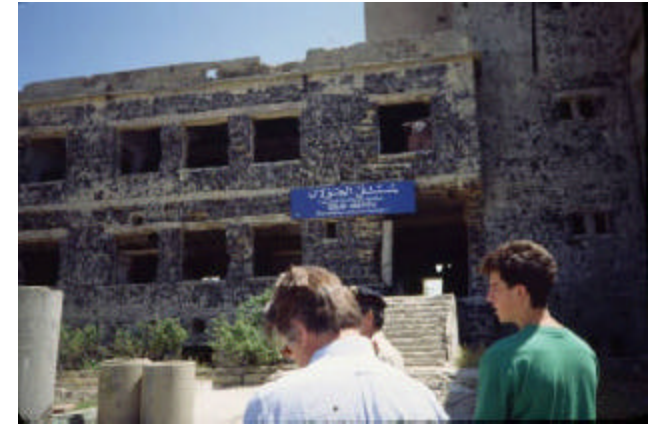
when I led my own delegation to Syria, I was able to take my wife Jane along and she was fascinated by the hospital. As a physical therapist she could see the way it was set up.

The hospital was a special case, two-storied, a very nice structure. During their six-year occupation, the Israelis had used it for commando training, treating it as a building to be captured during urban combat. It was shot up on the outside and smashed up on the inside. In a later year,