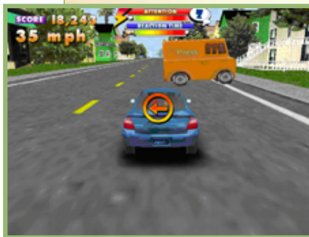
ABOVE: Teens use the Road Ready StreetWise software in the UMTRI evaluation. INSET: This screen shot from the Road Ready StreetWise game shows a sample road scene with an obstacle that teens had to avoid.