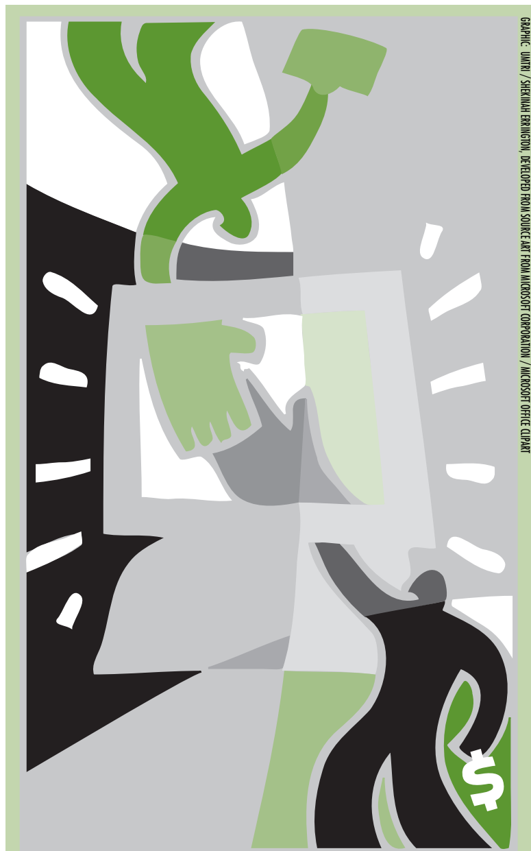
GRAPHIC: UMTRI / SHEKHAR ERINGTON, DEVELOPED FROM SOURCE ART FROM MICROSOFT CORPORATION / MICROSOFT OFFICE CLIPART

For more information on UM's Six Sigma programs, visit http://cpd.engin.umich.edu or www.osat.umich.edu/sixsigma.htm .