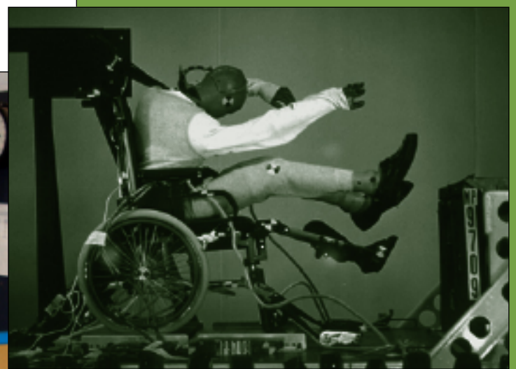
Top: Amy Klinkenberger and Carl Miller check a test setup. Above: This photo captures the peak-of-action during a frontal impact test of a wheelchair loaded with a midsize male ATD. Left: Stewart Simonett adjusts the controls of the UMTRI impact sled.