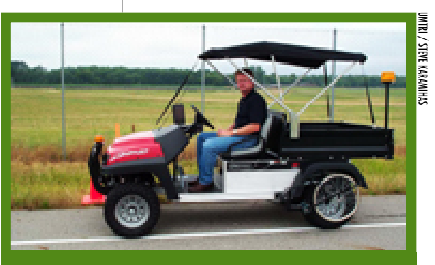
A lightweight profiler manufactured by Surface System Instruments is tested at a site in Lansing, Michigan.