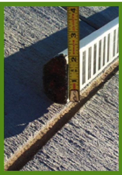
A rod used in the rod and level method of pavement measurement at a site in Bay City, Michigan.

The level of reproducibility between inertial profilers demonstrated on smooth concrete with coarse texture needs improvement for such profil-