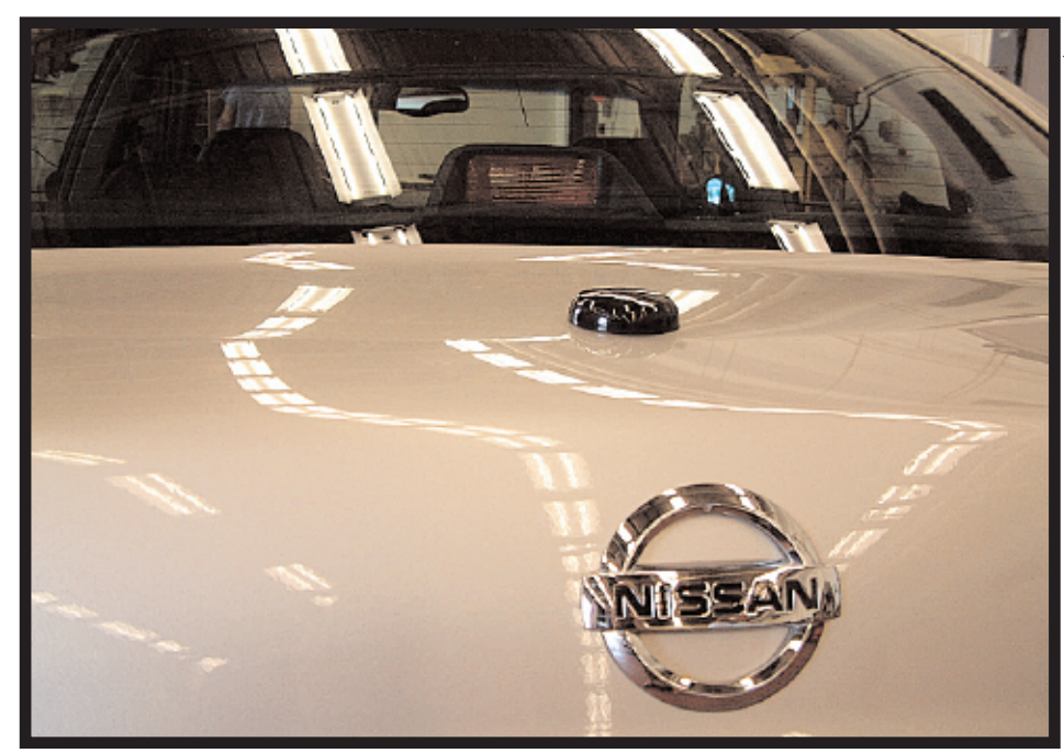
The curve speed warning system uses global positioning system (GPS) data and a precise, on-board map database to determine the current vehicle position, the most likely future path, and the geometry of the road along that path. The GPS antenna is visible on the test vehicle's trunk.

The data acquisition subsystem (DAS) collects more than 300 channels of data every tenth of a second throughout the field test. The data includes vehicle speed, lane position, location of lane and road edges, and any objects in the proximity of the vehicle, plus many signals indicating the driver's actions and the state of vehicle control. Data is gathered from radar sensors pointing in front of and to both sides of the vehicle, by video cameras pointed through the windshield and at the driver's face, and by means of several other instruments that monitor the motion of the vehicle and whether a cell phone is in use. A comment button, installed in the dash-