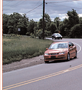
Cautions and warnings for both lateral drifts and curve speed are displayed on an LCD in the car's instrument panel.

CSW becomes active at speeds above 18 mph as long as GPS satellite tracking and map database coverage are available. Most of the field-test driving area (southeastern Michigan) is well mapped and supports CSW availability for approximately 90 percent of all miles driven. The system uses the turn signal and other cues to determine whether an upcoming exit ramp, or any other roadway branch, is likely to be the driven path.