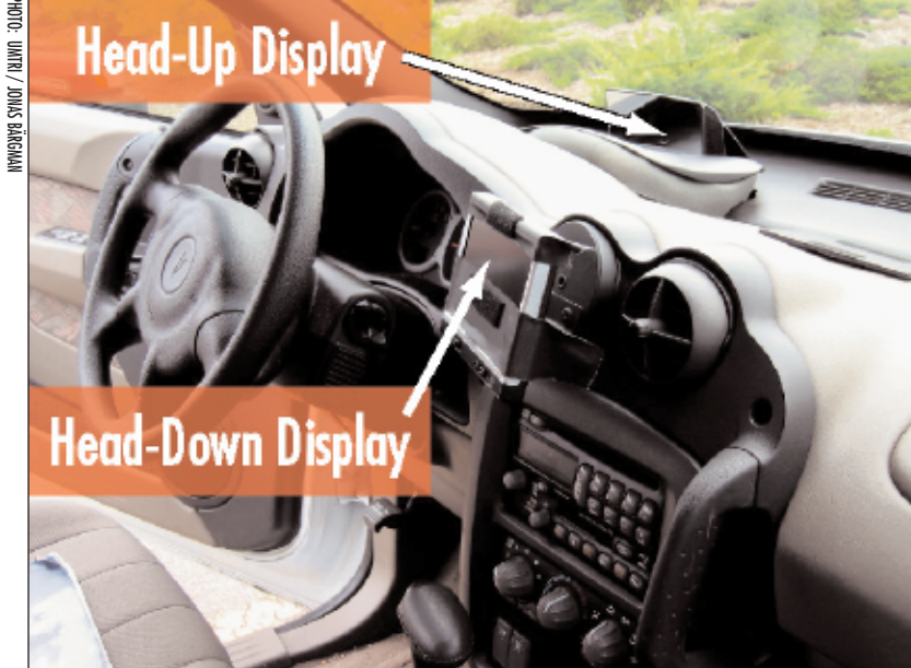
Locations of the head-up and head-down night vision displays in the test vehicle.

Another assessment area is the "locus of control," which can be either internal or external. Internal control refers to the perception of