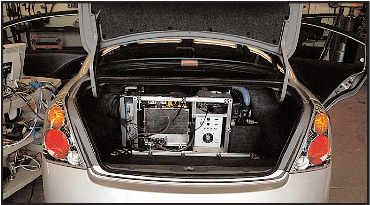
Much of the hardware needed for the lateral drift and curve warning systems is housed in the trunk of the test vehicles. The equipment is hidden behind a panel that subjects are asked not to remove.

available lateral maneuvering room on either side of the vehicle. It sends this information to the LDW so it can dynamically adjust its lateral drift warning thresholds.