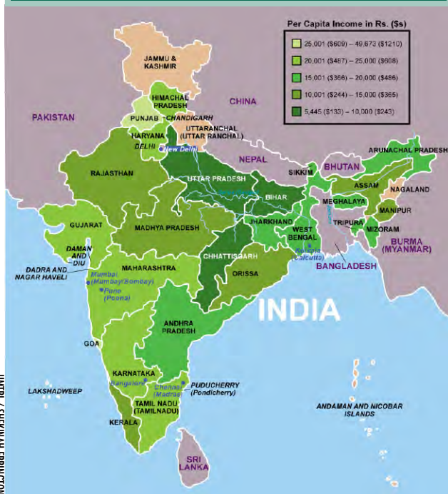
UMTRI / SHEKHAR ERINGTON

India is expected to be one of the top ten countries in vehicle sales by 2015, but it must overcome major obstacles to continue its rapid growth in the automotive industry, according to a recent study by UMTRI and the IBM Institute for Business Value. The world's second-most populous country, with more than 1.3 billion people, India faces such challenges as the need for a better transportation infrastructure, improved product quality, more skilled workers, changes in labor and tax regulations, and the need to increase the scale of their domestic companies to meet the demands of the global auto industry.