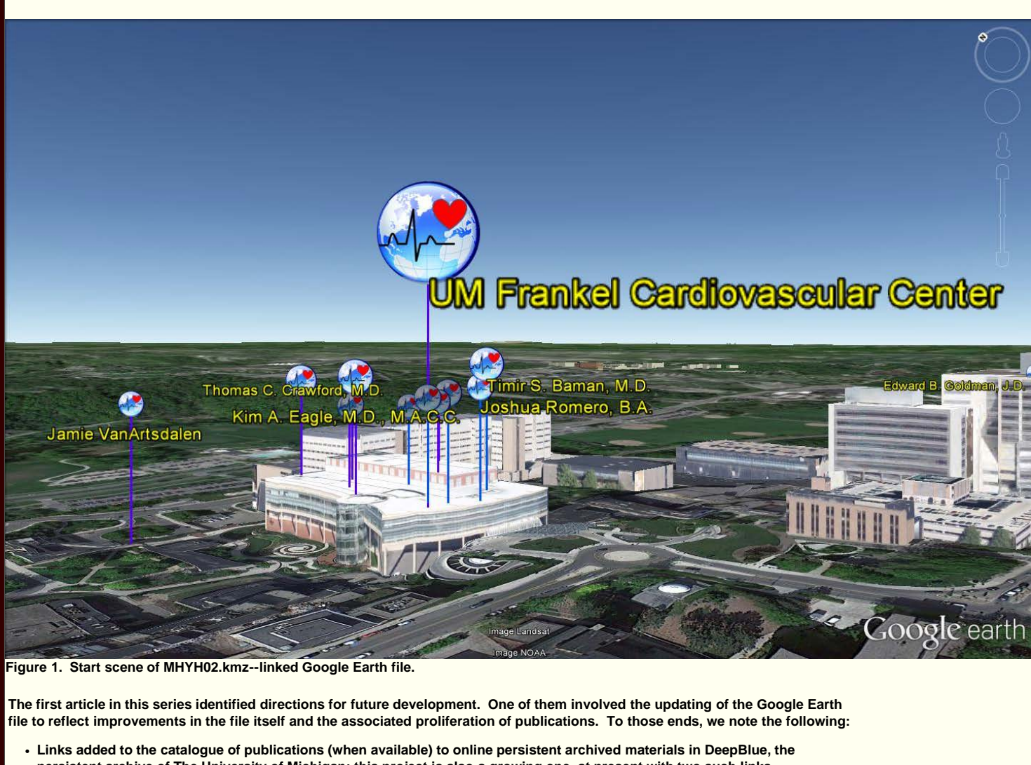
Figure 1. Start scene of MHYH02.kmz--linked Google Earth file.

Save the file on your computer in a location of your choice. Then, using the free version of Google Earth (presumably already on your computer; if not, install it if you wish to look directly at the Google Earth file). Then, open Google Earth and go to File | Open. Navigate to where you saved the file. Open it in Google Earth. The start scene should be similar to the image in Figure 1, below. If it is not, click on the title at the top of the Frankel Cardiovascular Center layer. Click on the 3D Buildings layer to bring up the buildings shown below.