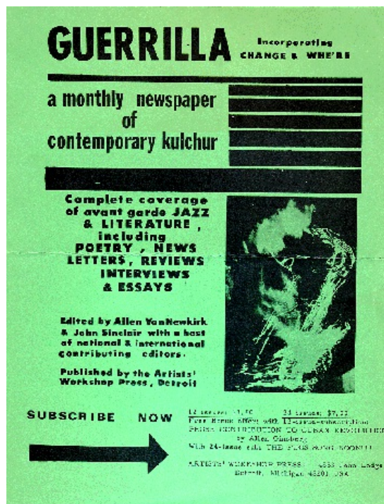
"Guerilla" was one of the many publications published by the Artist's Workshop Press in Detroit. John and Leni Sinclair papers, Box 7, "Artists Workshop Press 1964-1968-Guerilla."

any means necessary were the essence of the White Panther program.