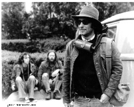
Abbie Hoffman with gas mask

John Sinclair was born October 2, 1941 in Flint, Michigan and grew up in nearby Davison where he graduated from high school in 1959. He attended Albion College (1959-61) and the University of Michigan, Flint College (1962-64), where he received an A.B. degree in American literature. In April, 1964, he entered graduate school at Wayne State University. He completed course work for an M.A. in American literature (thesis on William Burroughs' Naked Lunch ) before dropping out in the fall of 1965 to pursue his activities in the Detroit jazz and poetry community.