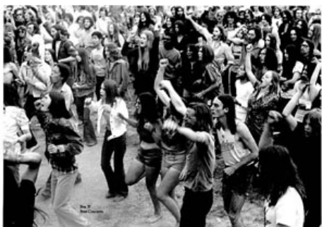
A typical crowd at one of the many free concerts held in Ann Arbor.