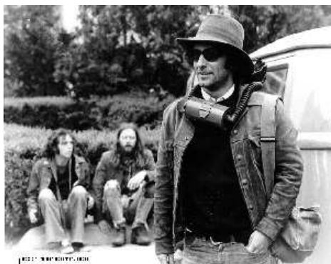
Abbie Hoffman with gas mask John and Leni Sinclair papers, Box 39, "Abbie Hoffman"

John Sinclair was born October 2, 1941 in Flint, Michigan and grew up in nearby Davison where he graduated from high school in 1959. He attended Albion College (1959-61) and the University of Michigan, Flint College (1962-64), where he received an A.B. degree in American literature. In April, 1964, he entered graduate school at Wayne State University. He completed course work for an M.A. in American literature (thesis on William Burroughs' Naked Lunch ) before dropping out in the fall of 1965 to pursue his activities in the Detroit jazz and poetry community.