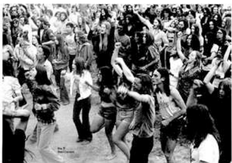
A typical crowd at one of the many free concerts held in Ann Arbor.