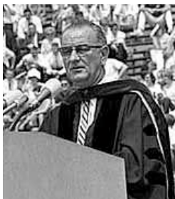
b1012299 [Pres. Johnson delivering "Great Society" speech]