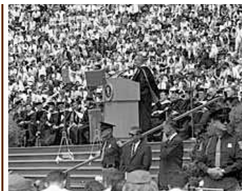
b1012300 [Pres. Johnson delivering "Great Society" speech]