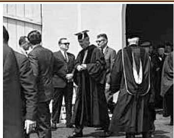
b1012301 [Pres. Johnson leaving Michigan Stadium]