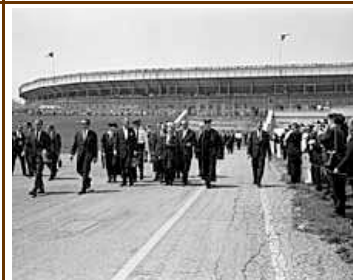
b1012303 [Pres. Johnson leaving Michigan Stadium]