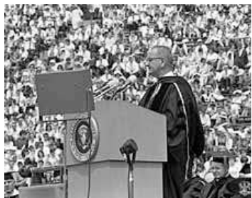
b1012298 [Pres. Johnson delivering "Great Society" speech]