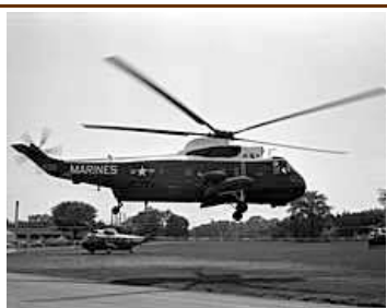
b1012307 [Marine Corps helicopter taking off]

All photos from the News and Information Services (University of Michigan) photo collection. Series C, #409.