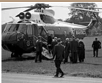
b1012305 [Pres. Johnson boarding helicopter]