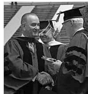
Pres. Johnson receiving his Doctor of Civil Law degree