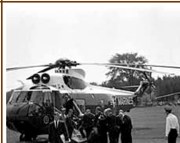
b1012304 [Pres. Johnson boarding helicopter]