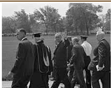
b1012306 [Pres. Johnson walking to helicopter]