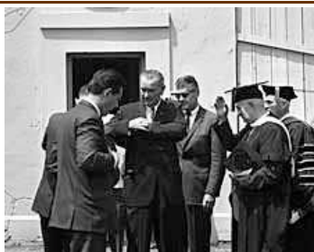
b1012302 [Pres. Johnson leaving Michigan Stadium]