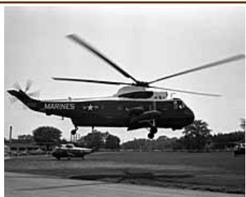
b1012307 [Marine Corps helicopter taking off]

All photos from the News and Information Services (University of Michigan) photo collection. Series C, #409.