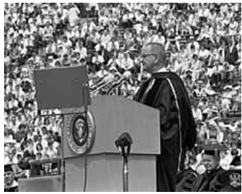
b1012298 [Pres. Johnson delivering "Great Society" speech]