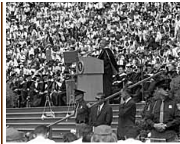
b1012300 [Pres. Johnson delivering "Great Society" speech]