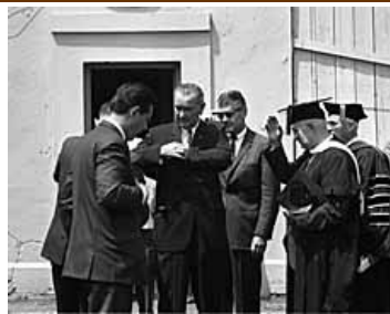
b1012302 [Pres. Johnson leaving Michigan Stadium]