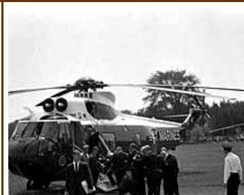
b1012304 [Pres. Johnson boarding helicopter]