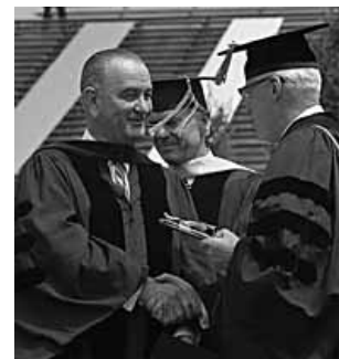
Pres. Johnson receiving his Doctor of Civil Law degree