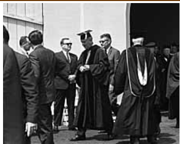
b1012301 [Pres. Johnson leaving Michigan Stadium]