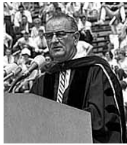
b1012299 [Pres. Johnson delivering "Great Society" speech]