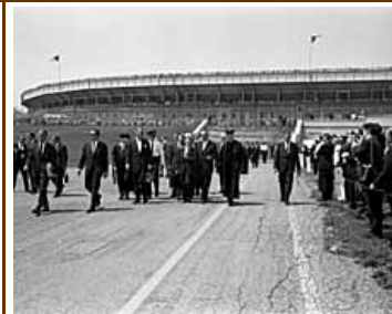
b1012303 [Pres. Johnson leaving Michigan Stadium]