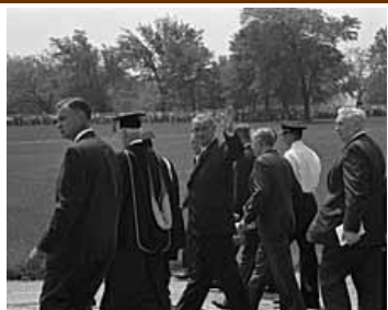
b1012306 [Pres. Johnson walking to helicopter]