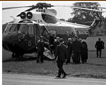
b1012305 [Pres. Johnson boarding helicopter]