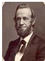
Thomas M. Cooley, 1871-1883