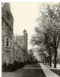
Law School ("The Lawyer's Club")

The Lawyers' Club--a dormitory and dining hall for law students--was the first building on the Law Quad.