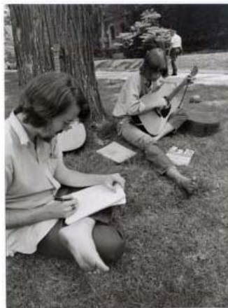
Two students--without helmets or shoes --rest in the Law Quadrangle, circa 1970.

1150 Beal Avenue Ann Arbor, MI 48109-2113 U.S.A. | 734.764.3482 | Fax: 734.936.1333 Reference: bentley.ref@umich.edu | Webmaster: bhlwebmaster@umich.edu Copyright ©2015 The Regents of the University of Michigan Last modified: July 05, 2007 3:37:22 PM EDT. Banner image from Jasper Cropsey's The University of Michigan Campus, 1855