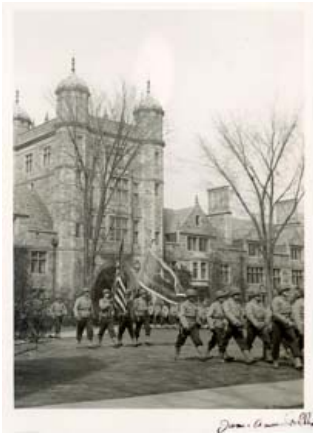
Judge Advocate General's School drill with helmets in the Law Quadrangle