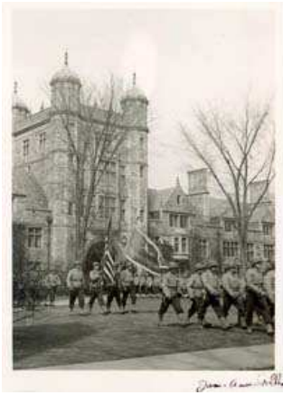
Judge Advocate General's School drill with helmets in the Law Quadrangle