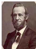
Thomas M. Cooley, 1871-1883