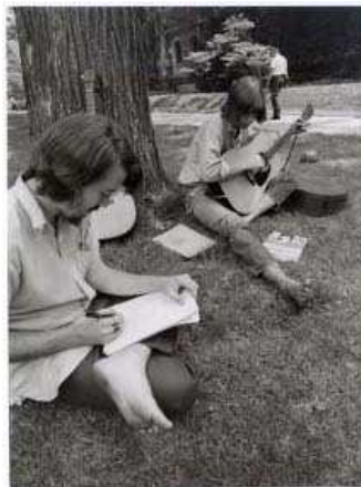
Two students--without helmets or shoes --rest in the Law Quadrangle, circa 1970.

1150 Beal Avenue Ann Arbor, MI 48109-2113 U.S.A. | 734.764.3482 | Fax: 734.936.1333 Reference: bentley.ref@umich.edu | Webmaster: bhlwebmaster@umich.edu Copyright ©2015 The Regents of the University of Michigan Last modified: July 05, 2007 3:37:22 PM EDT. Banner image from Jasper Cropsey's The University of Michigan Campus, 1855