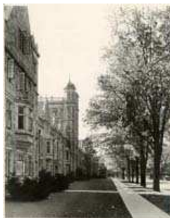
Law School ("The Lawyer's Club")

The Lawyers' Club--a dormitory and dining hall for law students--was the first building on the Law Quad.