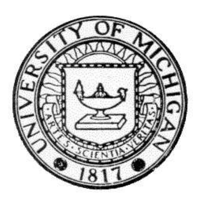
Lamp of Wisdom Seal with 1817 founding date