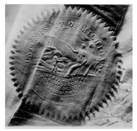
1843 Minerva Seal

The later seal has a curved line below the design and the boy's figure looks quite different. The last cutting includes the curved line but adds more stars in the outer margin and several other differences in detail.