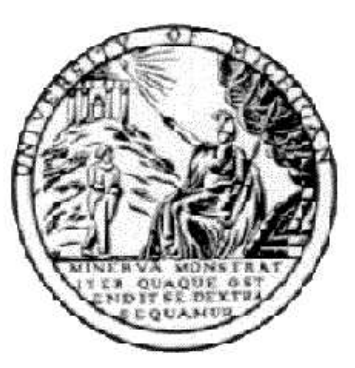
Impressions made from two versions of the 1843 Minerva Seals found in the Office of the President, September 1995.