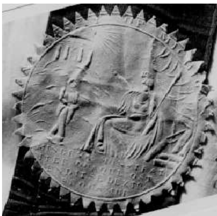
1843 Minerva Seal

Impressions made from two versions of the 1843 Minerva Seals found in the Office of the President, September 1995.