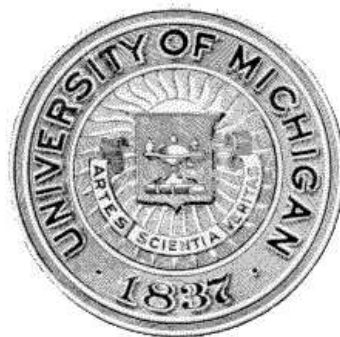
1895 Seal with 1837 founding date