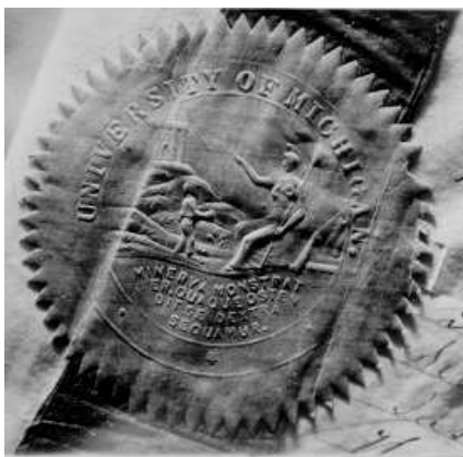
1866 Minerva Seal

The Minerva seal went through at least one major recutting in 1865 and one minor one. As first adopted, a straight line divided the motto from the design.