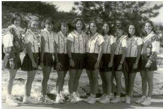
1994 UM Women's Tennis team