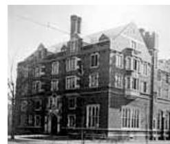
Martha Cook Building

1968 - On April 9, minority students under the Black Student Union take possession of the LS&A building demanding increases in minority enrollment and support services for minority students. 39