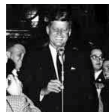
JFK Peace Corps Speech at Union

1960 - On October 14 John F. Kennedy announces the concept of the Peace Corps during a presidential campaign stop on the steps of the Michigan Union. 63