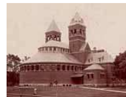
Original General Library