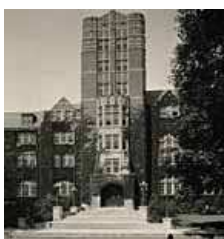
Front of the Michigan Union, ca. 1950

1947 - Center for Japanese Studies formed.