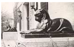
Pumas at entrance to University Museums Building

1913 - Department of Architecture established, it becomes a College in 1931. Architecture had been a sub-department under the Department of Engineering from 1906-1913.