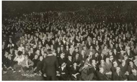
Cap Night, 1916

1904 - First "Cap Night" celebrated on June 11, later to be abolished in 1934. 7