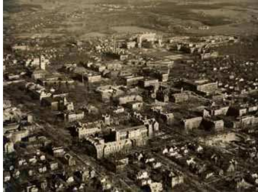
Campus Aerial View, ca. 1947