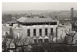
Rackham Building construction, March 1937

1937 - Newberry Hall is purchased by the University of Michigan. The archeological collections move into Newberry Hall in 1928, and the museum is named the Kelsey Museum in 1953. 16