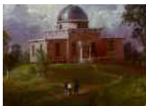
Detroit Observatory of the University of Michigan

Detroit and known as the "Detroit Observatory." 8