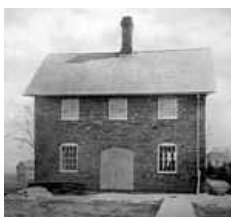
First Engineering Building at University of Michigan, ca. 1882

1894 - Literary Class of '94 is the first to wear academic gowns at a Michigan commencement. 9