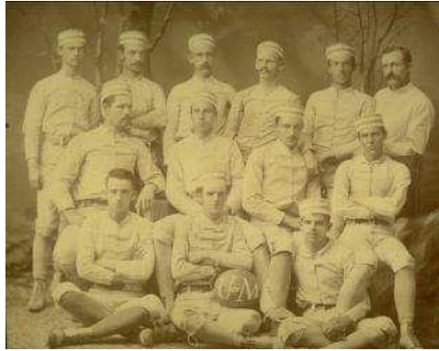
The First UM Football Team, 1879

1860 - Founding of the Pioneer Cricket Club, the first organized sports activity on campus.