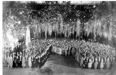
Junior Hop, 1920

1900 - "In 1900, when interdepartmental rivalry ran high among the students, the "Lits" [Literature students] raised the class banner, flaunting the numerals of the class, to the top of the University flagpole. The enraged "Laws" [Law School students] enlisted the aid of a sharpshooter from the West, who brought the emblem down at the second shot. During the early 1900's, the practices of haircutting, face-painting, house-raiding, kidnapping - particularly of officers of the rival classes - were common." Read more about student traditions and rivalries . (from The University of Michigan, an Encyclopedic Survey , p. 1775)