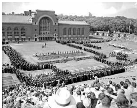
Commencement, June 11, 1949. Graduates filing into stands at Ferry Field

1872 - First Asian student (Japanese) is admitted to UM, Saiske Tagai, literature. 6