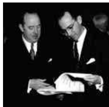
Polio evaluation meeting, Dr. Thomas Francis, Jr., Dr. Jonas E. Salk

1955 - North Campus recognized as a campus geographic area. 58