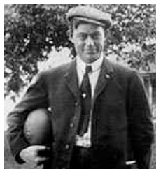
Fielding H. Yost

1899 - The nickname " Wolverine " applied to UM football teams first appeared in the Michigan Daily on November 11, 1899. 6