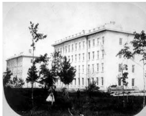
Mason Hall, 1861 Original University Instructional Building in Ann Arbor, built in 1841