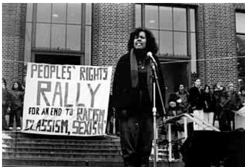
People's Rights Rally, January 1, 1981