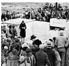
Women's League Cornerstone Laying