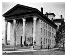
Old Medical Building

1848 - Regents authorize organization of the Department of Medicine and Surgery. The department becomes a school in 1915.