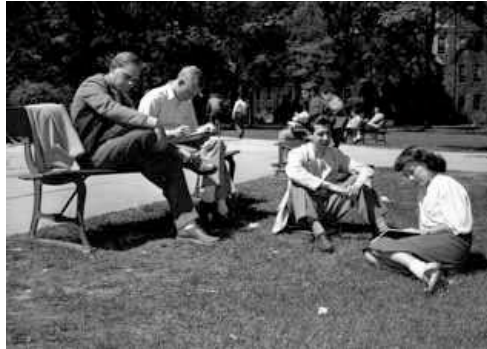
Students Studying on the Lawn, 1946

1845 - First fraternities, Beta Theta Pi and Chi Psi, established at Michigan. 1