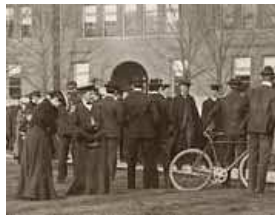
Senior Swing Out, 1903

1927 - "Freshman Week" established as a period of preparation for student life for incoming students.