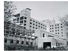
South Quad Dorm under construction, May 1952