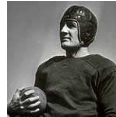
Tom Harmon, 1940

1981 - Women's athletic programs officially admitted into the Big Ten Conference. 20