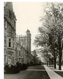
Lawyers Club, ca. 1925

1954 - Department of Atmospheric, Oceanic, and Space Sciences founded. 22