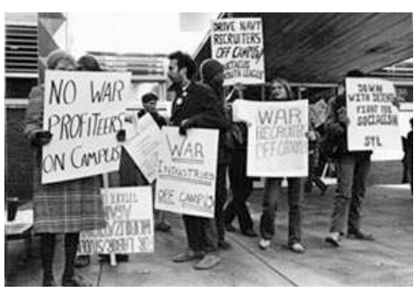
Protestors demonstrate against corporate recruiters with known war research affiliations, from Michigan Daily Photograph collection, Box 12.

Tensions over the university's involvement in secret war research culminated in October 1967, when hundreds of students occupied the Administration Building. They were opposed to the University's involvement in a Department of Defense project with the Royal Thai Armed Forces.