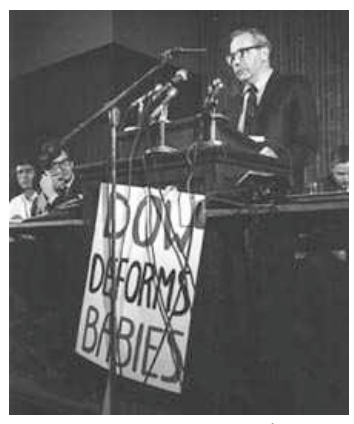
Protests at a recruiting event by Dow Chemical

In 1968, the Research Policies Committee (RPC) reviewed the issue of secret research and recommended that the university decline contracts that would ultimately result in human death or incapacitation.