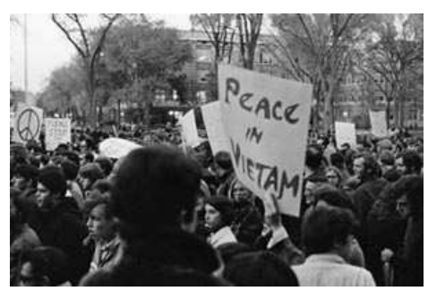
Students gather on the University of Michigan's Central Campus to protest the Vietnam War.

midnight speech at the Michigan Union on October 14, 1960, in which he proposed what would later become the Peace Corps, proved to be a catalyst for student empowerment. Students rallied behind the idea, excited to do their part to help the global community. This enthusiasm spread to concerns in the United States, concerns that