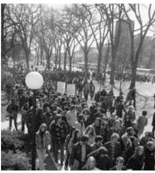
Students support BAM strike.

Formed by various student groups, BAM's aim was to assist minority students and to increase minority acceptance at the university. In March of 1970, when the Regents would not pledge to meet BAM's goals, they called for a campus-wide strike.