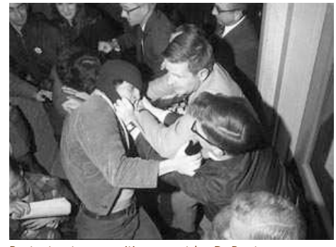
Protests at a recruiting event by DuPont

the Engineering Department was housed at the time.