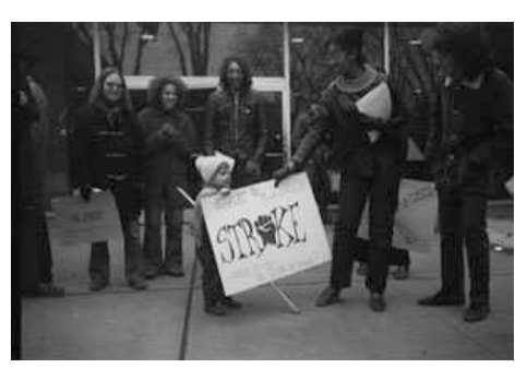
A young strike supporter.