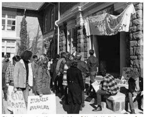
Students protesting outside of North Hall, home of the ROTC.

Beginning in 1967, students at universities and colleges across the United States mounted campaigns against ROTC. This lead to several universities making ROTC participation voluntary; other schools chose to deny academic credit for ROTC classwork. Both of these changes hurt ROTC enrollment.