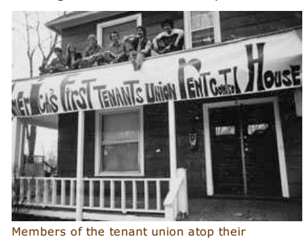
rent-controlled house.

In an attempt to help students with these difficulties, the Student Government Assembly and the Student Housing Association decided to institute an eight-month lease, thereby making it easier for students who left Ann Arbor in the summer. Apartments Ltd refused to use the lease, which only infuriated students more. In retaliation, the Student Housing Association named Apartments Ltd. as a boycott target.