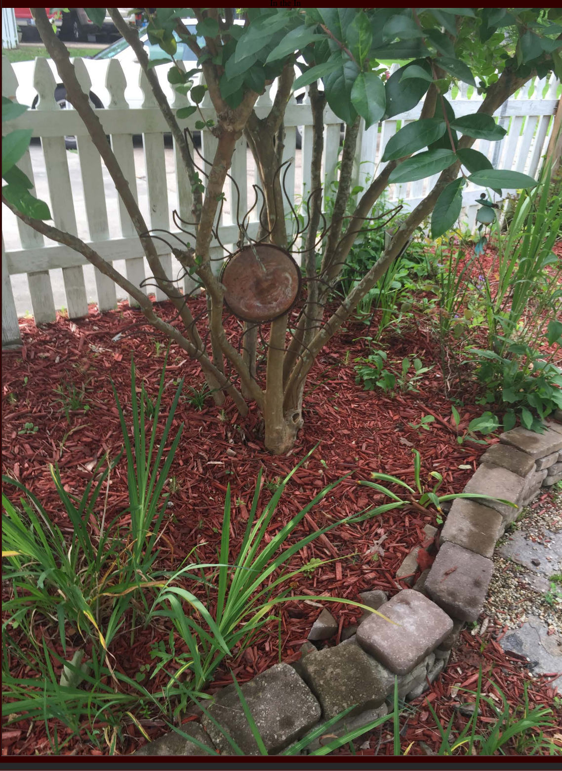
In the Solstice Garden (above), Meridian, Mississippi: A place without parallel!