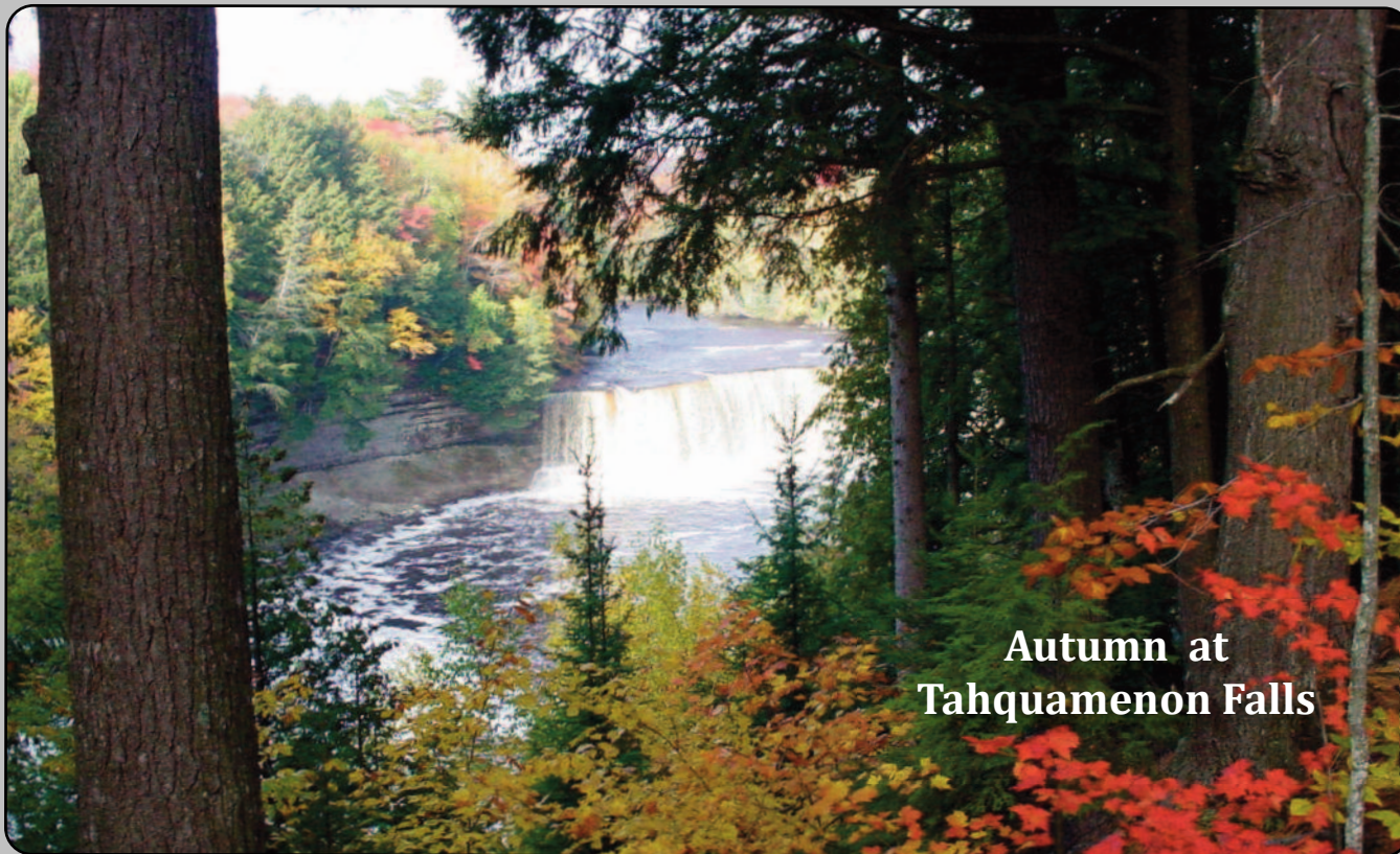
Autumn at Tahquamenon Falls

Michigan's Conservation Sentinel Since 1953