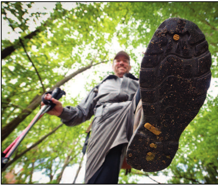
Good boots are essential for this Taylor resident, who recently trekked more than 900 miles across Michigan from Belle Isle to Ironwood.