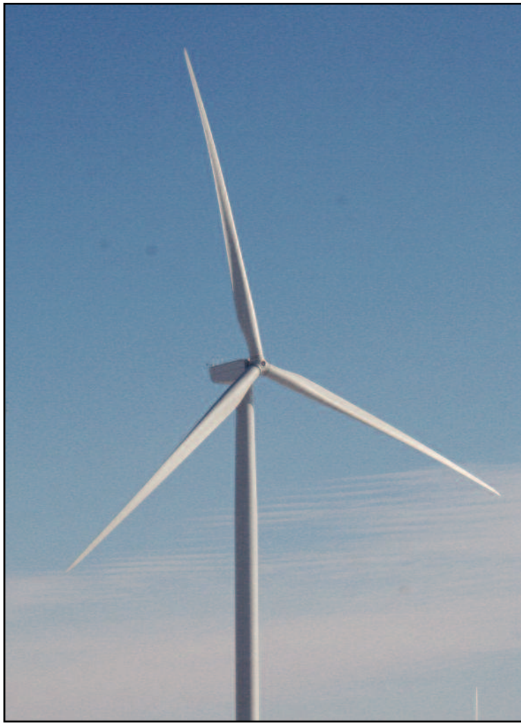
Rotating blades on energy producing windmills are deadly.

As briefly mentioned in the last North Woods Call , wind energy facilities have killed at least 67 golden and bald eagles in the past five years, according to a report published recently in the Journal of Raptor Research .