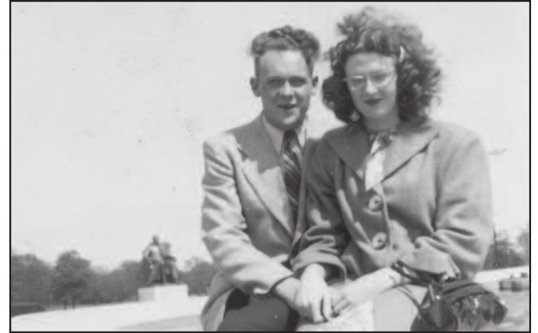
The newlyweds on Belle Isle during a windswept day in May of 1947.

sudden care-givers know that none of this is easy to handle. It's as if some sort of awful latter-day penalty awaits those who live too long and too well.