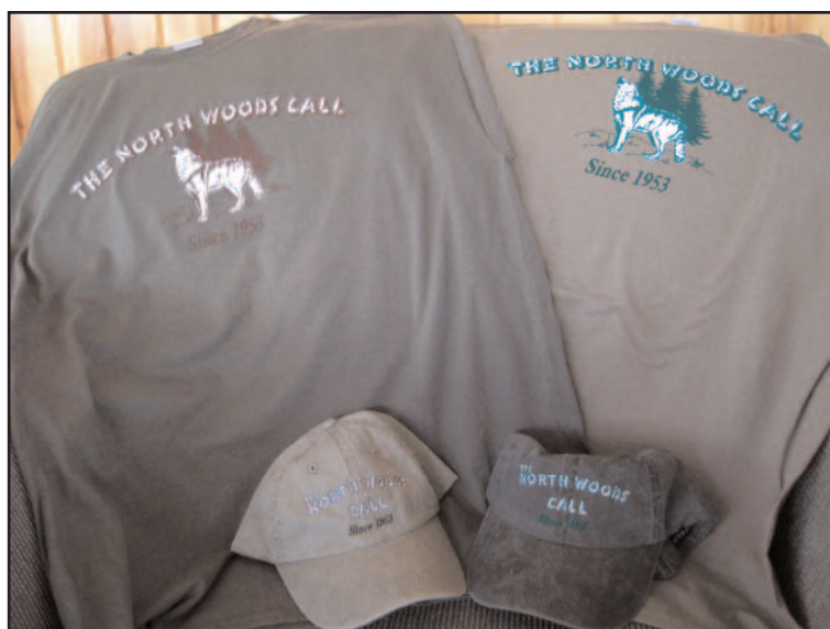
T-shirts (military green & prairie dust) and caps (khaki & hunter green)

Stuff those stockings with North Woods Call apparel