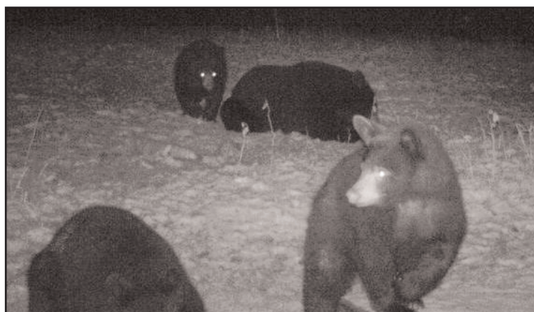
A trail camera photo provided by the Michigan Department of Natural Resources shows a bear sow and three cubs seen in the vicinity of the poaching incident. The sow is believed to be the one poached.

The male had facial hair and left the scene driving a dark-colored pickup truck. The DNR Law Enforcement Division is request-