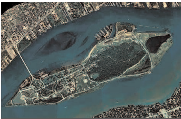
An aerial view of Belle Isle in the Detroit River.