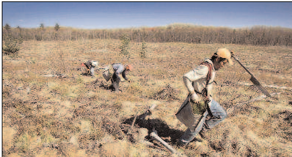
DNR workers replant jack pine (above) within two years of a clear-cut, while aspen—like the one-year-old stand shown below—begins regenerating almost immediately after being cut.