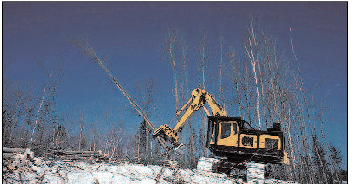
Clear-cutting helps regenerate species that can't compete in mature forests, according to the DNR. Both aspen and jack pine are routinely clear-cut. Aspen (pictured) must be clear-cut to maximize regeneration.

Aspen is typically managed on 40- to 60-year rotations for several reasons. That's not only when