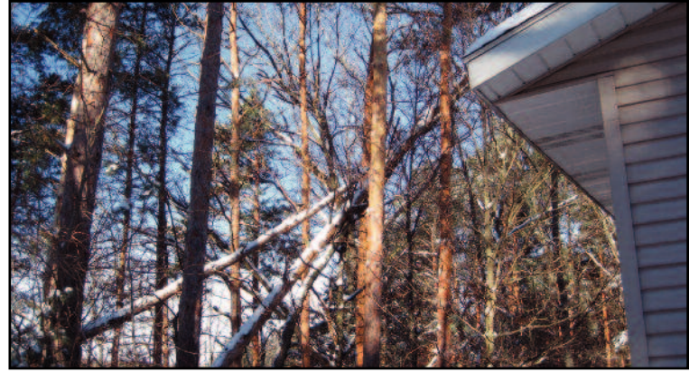
Scotch pine trees pose a threat at the current world headquarters of The North Woods Call .

there had been an additional 27 percent drop in those figures.