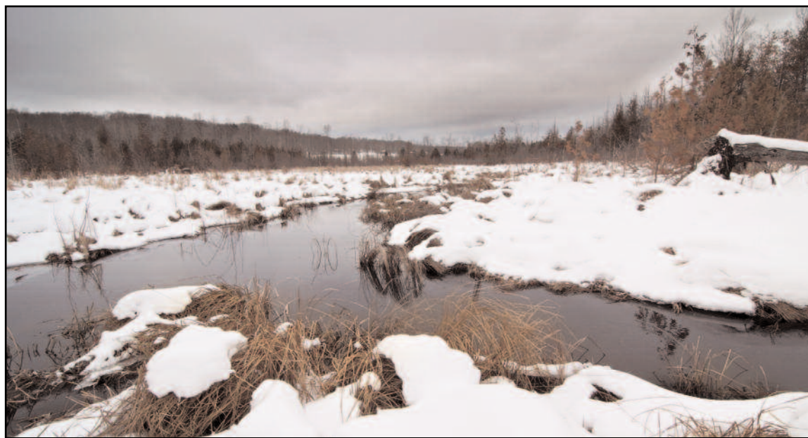
Horton Creek was one of author Ernest Hemingway's favorite fishing spots when he was a boy spending his summers in Michigan. Two nature preserves have now been established along the creek, thanks to efforts by the Little Traverse Conservancy.

For example, the Conservancy offers year-round education outings and community field trips. In 2013, more than 3,700 students participated in a Conservancy-led nature outing and 551 people participated in seasonal community field trips led by staff and volunteers. Almost all of these programs are offered at no charge, and funds are available to help