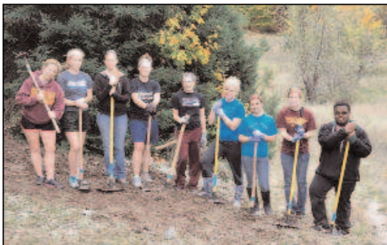
Volunteers are essential to the ongoing work of The Little Traverse Conservancy and more than 3,700 young people participate in the organization's environmental education outing each year.