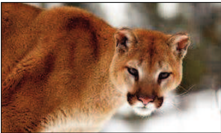
Several cougars—also known as mountain lions, pumas, panthers, mountain cats, or catamounts—have been reported in Michigan.