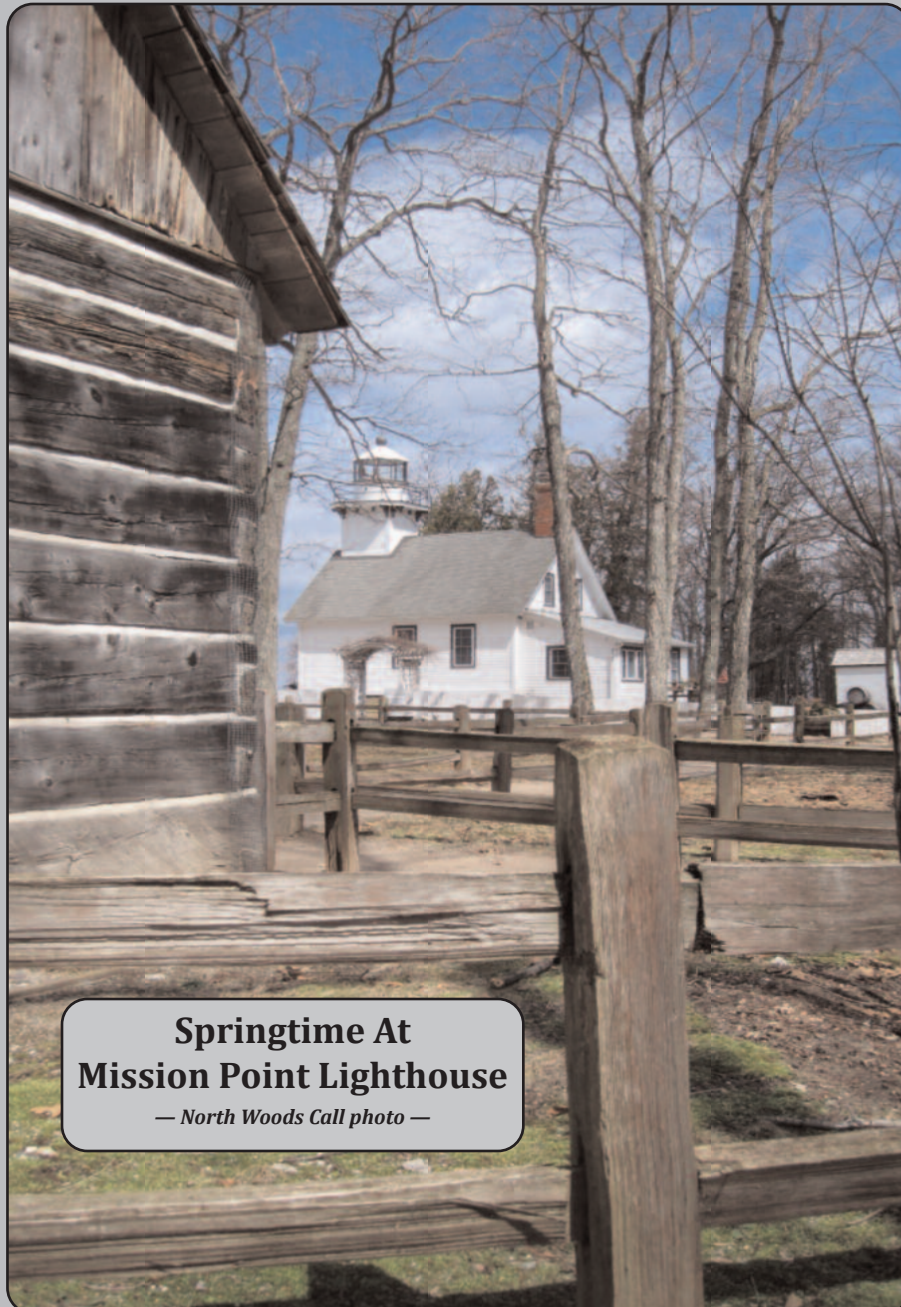
Springtime At Mission Point Lighthouse

Michigan's Conservation Sentinel Since 1953