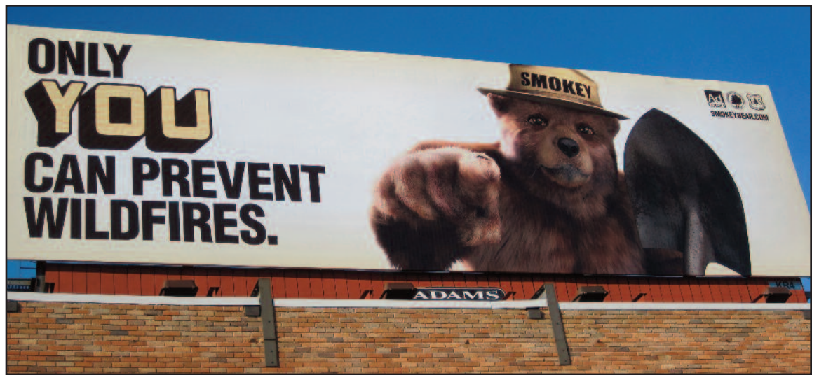
Some roadside advertising contains useful public service announcements, but the billboards on which these messages appear still block views and mar landscapes, even in urban areas.

Let’s support such activists in their struggles against giants and thank them for at least trying to make a difference.