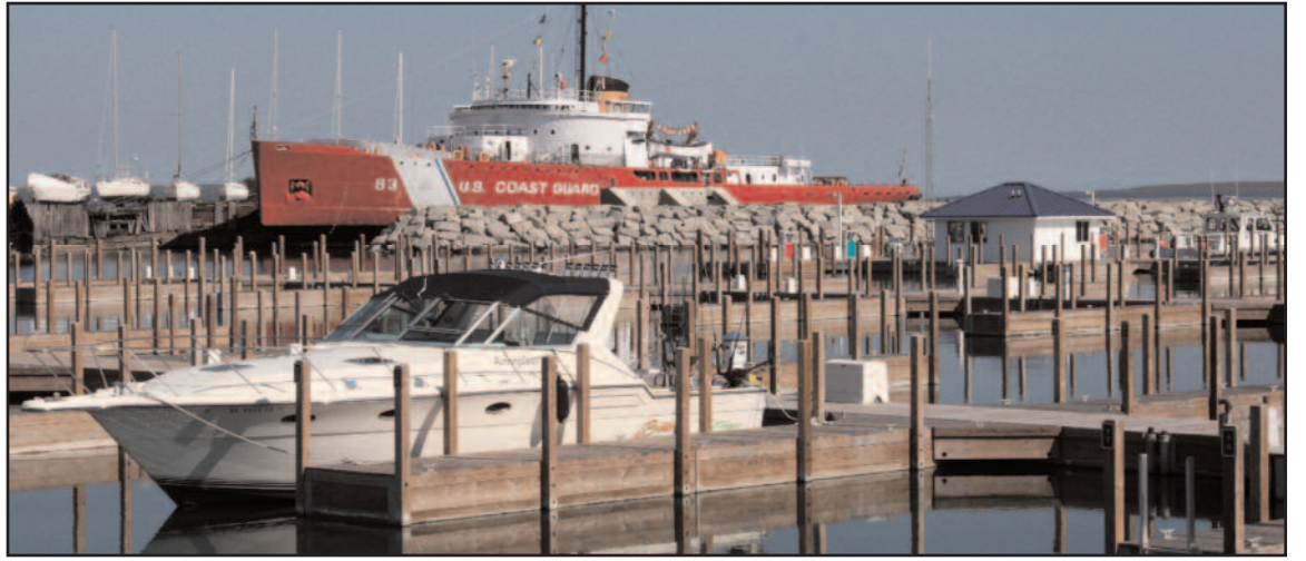
Much of the Straits of Mackinac could be harmed if Enbridge's pipeline were to rupture and spill into the water, conservationists say, such as the Mackinaw City Marina shown here.

Citizens may also "seek recourse" to make sure public and private uses are protected, he said.