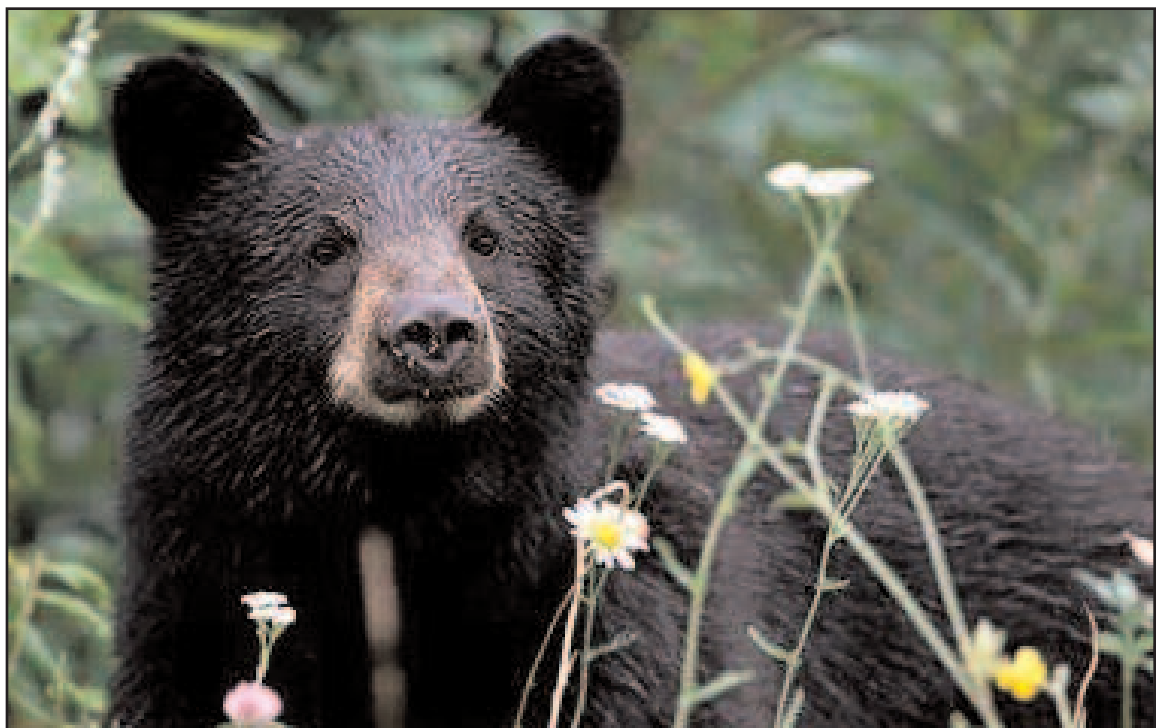
The buying and selling of black bear parts is illegal in Michigan, because it creates a market for the parts, and provides a financial incentive for poachers to unlawfully take the animals during closed seasons and in excess of established limits, according to Michigan Department of Natural Resources officials.

Representatives from both Chesapeake and Encana were scheduled to be arraigned on March 19 in Cheboygan County's 89th District Court.