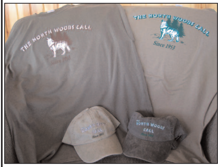
T-shirts (military green & prairie dust) and caps (khaki & hunter green)

$10 (plus $2.50 each shipping/handling) Close-out sale!