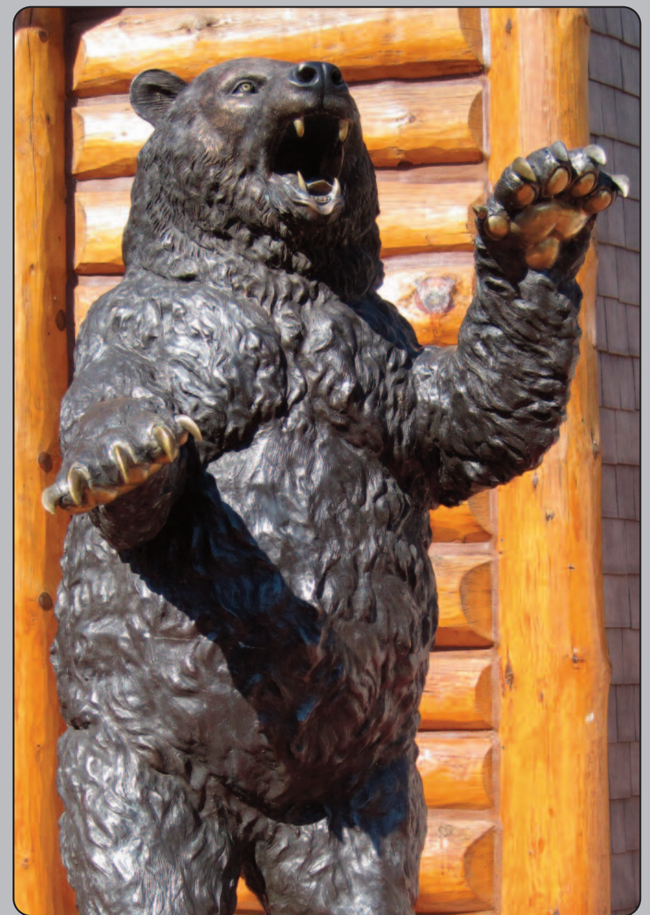
Life's struggles can sometimes swat us like an angry bear.