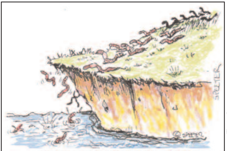
Freaked out by oil and gas fracking activities, the earthworms finally opted for mass suicide.