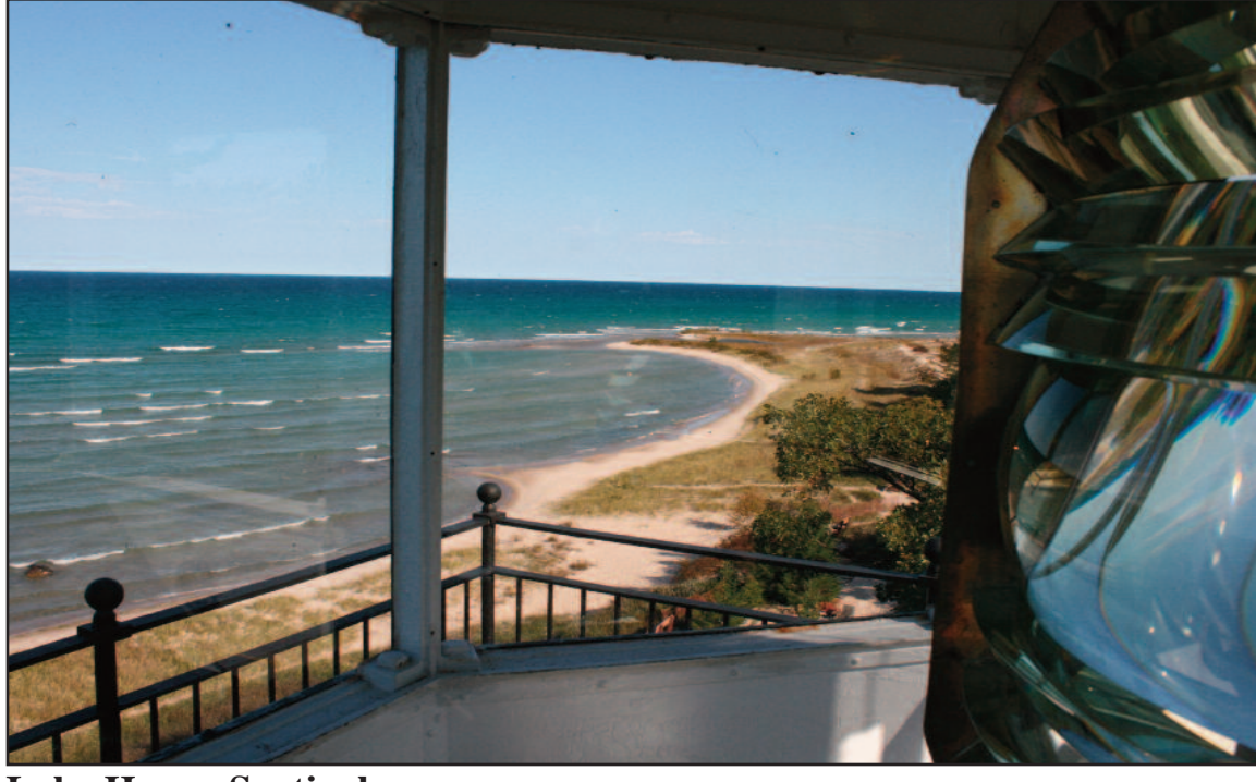
Lake Huron Sentinel

The big lake is relatively calm in this view from the lighthouse at 40-Mile Point near Rogers City. But like life itself—rough waters have been frequent and many ships over the years have relied on the guiding light to make it safely to their destinations. Not all have made it, however, as the number of historic shipwrecks under the clear, blue water will testify. North Woods Call readers have no doubt discovered by now that the publisher's family is currently being rocked by unexpected storms (see story on Page 1 and column on Page 4) that have left us with few options other than to halt publication for the time being. Whether the suspension becomes permanent remains to be seen, but we're hoping for smoother sailing ahead.