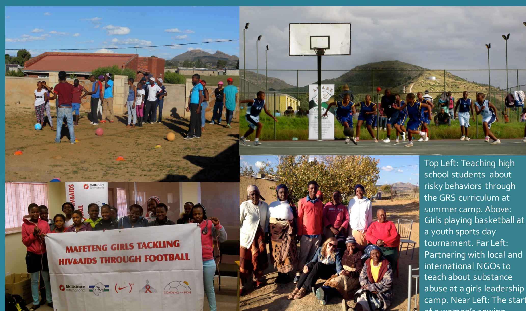
Top Left: Teaching high school students about risky behaviors through the GRS curriculum at summer camp. Above: Girls playing basketball at a youth sports day tournament. Far Left: Partnering with local and international NGOs to teach about substance abuse at a girls leadership camp. Near Left: The start of a women's sewing group in my village.