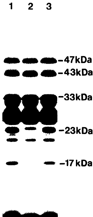
Fig.1. Gel electrophoresis patterns of: (1) control; (2) high-salt extracted membranes; (3) reconstituted PS II membranes. Reconstitution was carried out by resuspension of salt-washed PS II membranes in a fraction of the 2 M NaCl extract containing the 17 and 23 kDa polypeptides, followed by subsequent removal of NaCl by dialysis against a solution containing 0.4 M sucrose, 15 mM NaCl, 50 mM Mes (pH 6.0) (four 2-h steps, 4^\circ\text{C} ). After the last dialysis step the PS II membranes were pelleted by centrifugation, washed once with the pH 6.0 buffer used above, and resuspended in the same buffer. The amount of the polypeptides added back for the reconstitution experiments was usually equal to the amount removed by high-salt extraction. During dialysis the volume of the dialysis medium was one hundred times the volume of the sample in the dialysis bag. The gel contains 2 M urea. (It should be noted that there are two polypeptides in the 23 kDa region; one is the 23 kDa water-soluble polypeptide removed by high-salt treatment of the PS II complex and the other is a polypeptide, with higher molecular mass, which is not removed by either 2 M NaCl or even high pH (10); a better separation of the two polypeptides is observed when a higher concentration of urea is present during SDS gel electrophoresis.

Treatment of PS II membranes with 2 M NaCl results in removal of two water-soluble polypeptides with molecular masses of 17 and 23 kDa (fig.1, lane 2) [1–3]. High concentrations of NaCl apparently perturb the electrostatic interaction between the 23 and 17 kDa species and the rest of the PS II complex, but substantial activity can be restored to the depleted PS II complex upon addition of \text{CaCl}_2 to the assay medium [4]. This observation, along with several previous studies on