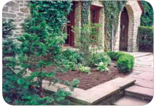
Inglis House Entrance