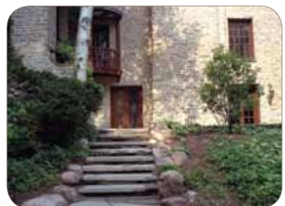
The Inglis Highlands Gardens 1990s