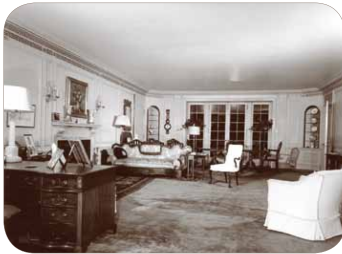
Living/Dining Room (above), Library (below)