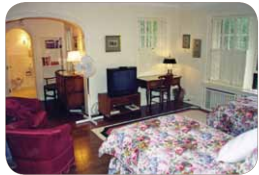
Master Bedroom, Meadow Bedroom (above), Garden Bedroom, Stairway to Third Floor (below)