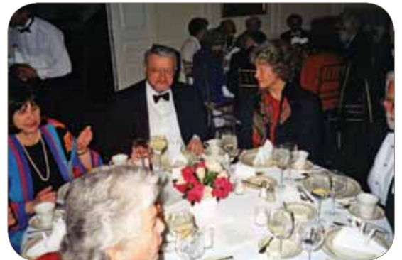
Faculty Events at the Inglis Highlands