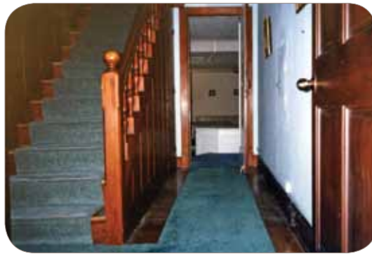
Third Floor Hall to Maid's Apartment, Stairs to Fourth Floor