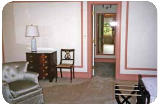
Master Bedroom (above), Master Closet, Bathroom and Stairway to Third Floor Bedrooms (below)