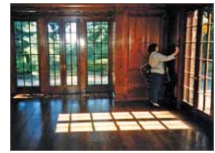
Inglis House in the 1970s/1980s and 1990s after the renovation