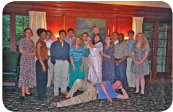
Student Events at the Inglis Highlands