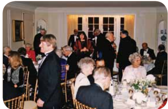
Faculty Events at the Inglis Highlands