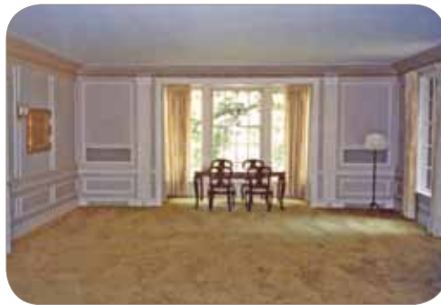
Living/Dining Room (above), Breakfast Room (below)