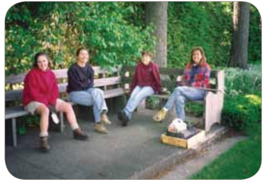
The East Lawn - Originally the Tennis Court