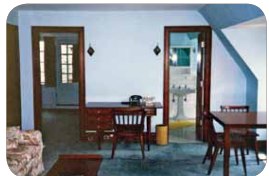
Fourth Floor Sitting Room