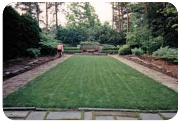
The Formal Garden