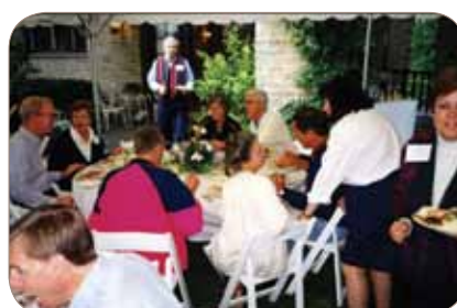
Deans & Directors Events at the Inglis Highlands