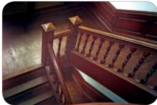
Second Floor Stairway