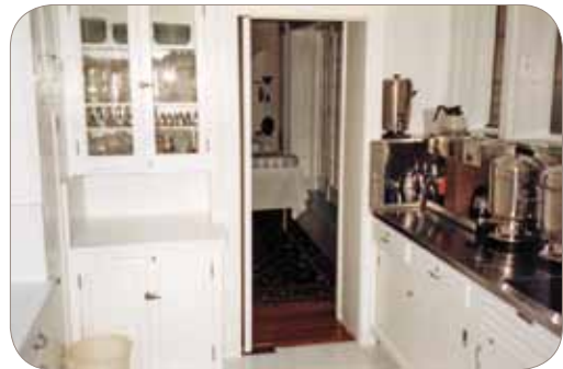
Breakfast Room, Kitchen and Serving Pantry