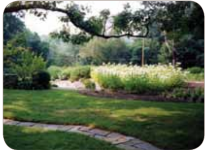
The Inglis Highlands Gardens 1990s