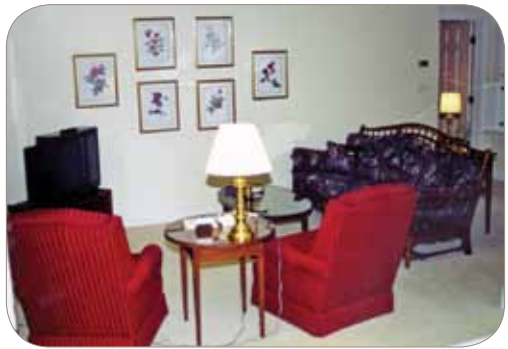
Maid's Apartment (above), Fourth Floor Bedrooms & Sitting Room (below)