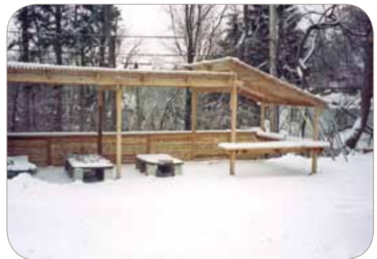
Building the Lath House