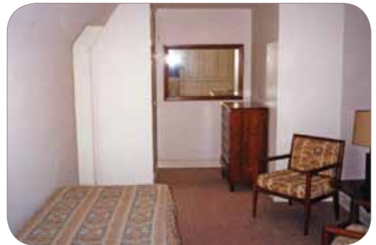
Fourth Floor Bedroom