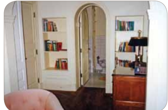
Meadow Bedroom (above), Garden Bedroom (below)