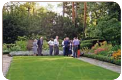
Deans & Directors Events at the Inglis Highlands