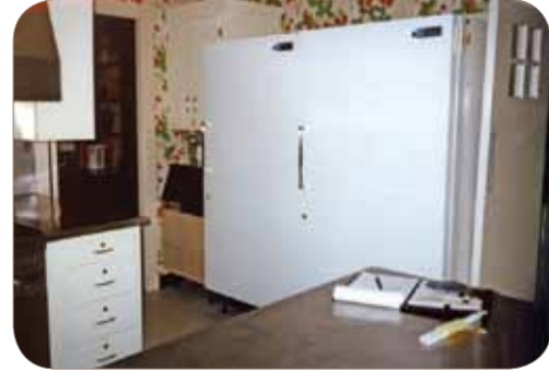
Kitchen (above), Serving Pantry (below)