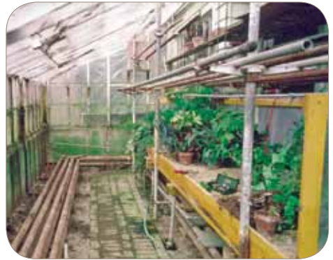
Original Greenhouse (above), New Greenhouse (below)