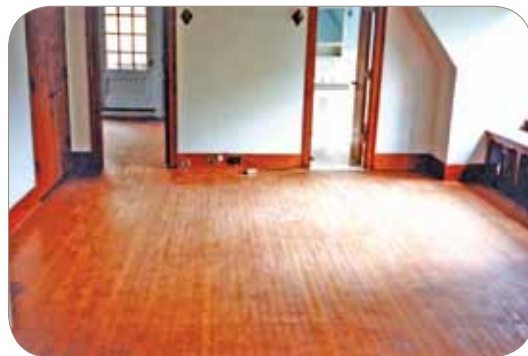
Fourth Floor Sitting Room