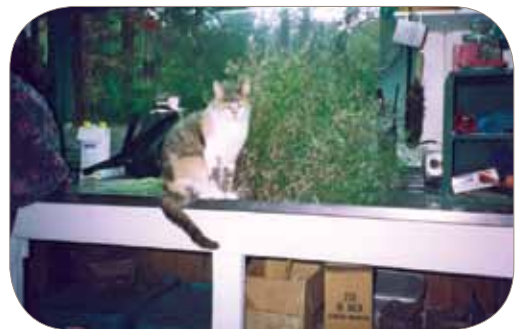
Renovating the Shed, Drying Shed (Original Peacock House), Shop, Peaches, the Inglis Highlands Cat