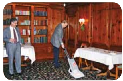
Regents, Executive Officers Events at the Inglis Highlands