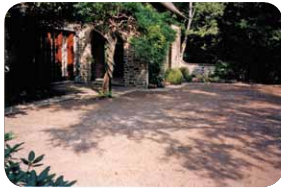
Formal Garden Lawn