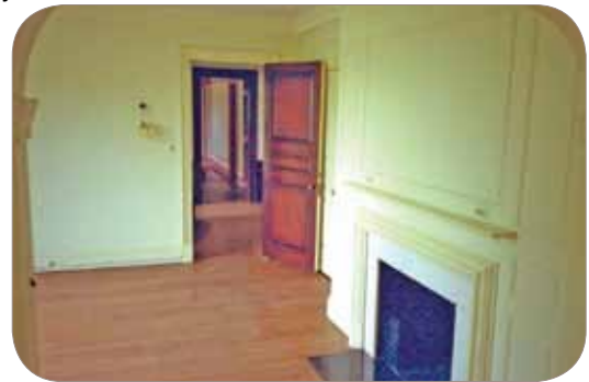
Second Floor Bedrooms