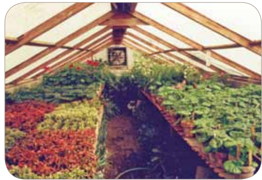
Rebuilding Cold House (above), Rebuilding the Hot Frame (below)