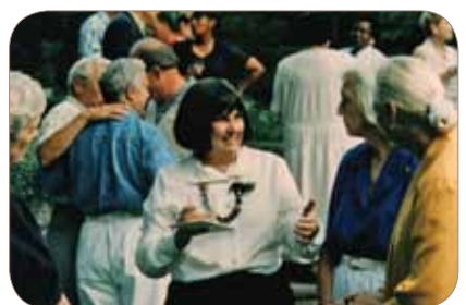
Regents, Executive Officers Events at the Inglis Highlands