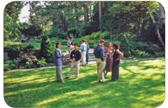
Student Events at the Inglis Highlands