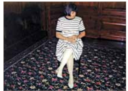
Inglis House in the 1970s/1980s and 1990s after the renovation