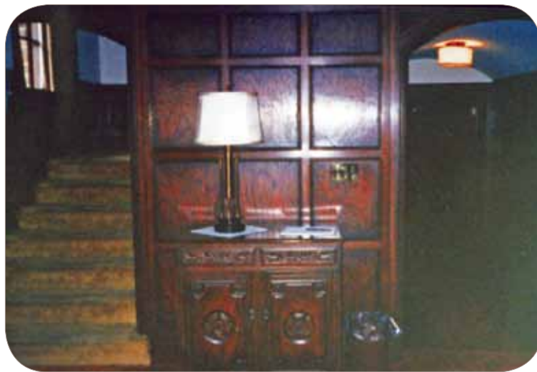
Entrance Hall (above), Ladies Powder Room (below)