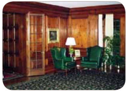
Inglis House in the 1950s, 1970s and 1990s after the renovation