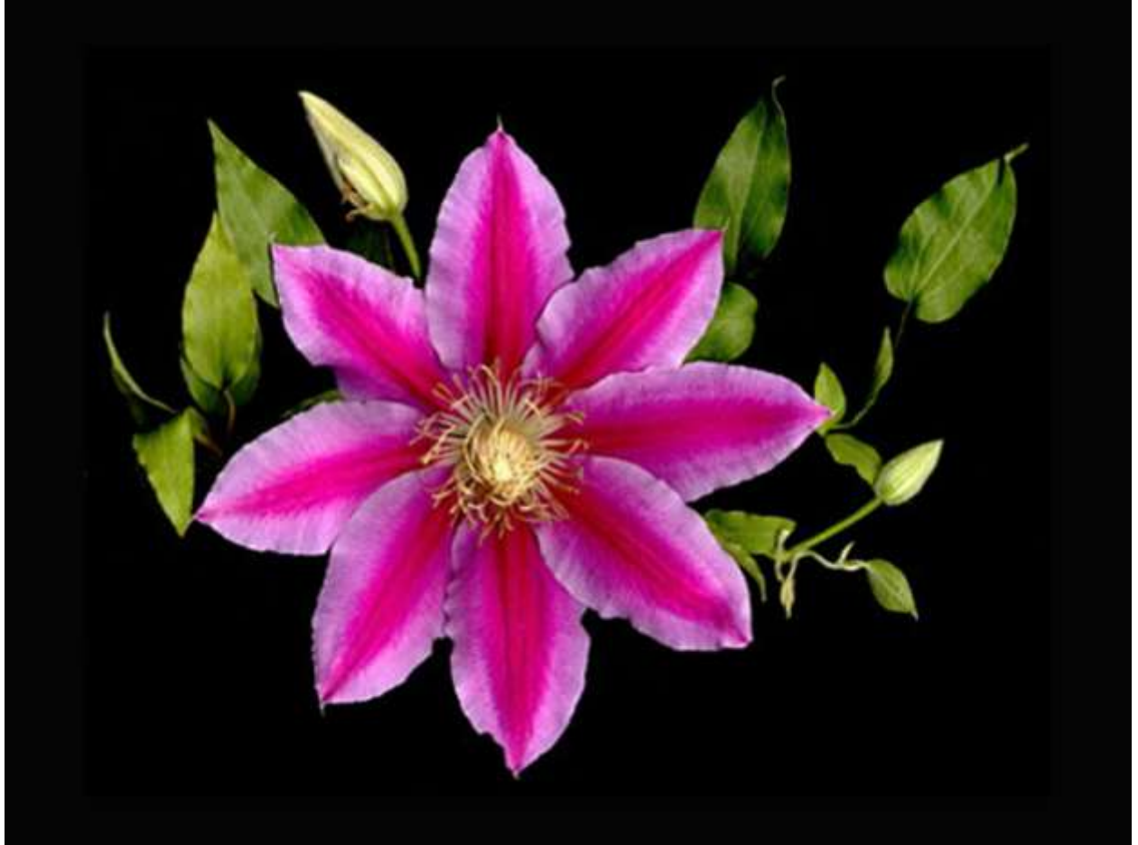
Clematis: Displayed in juried art fair, Ann Arbor, MI. On display in glass display case in the basement of the Ann Arbor Public Library. Later in her apartment.