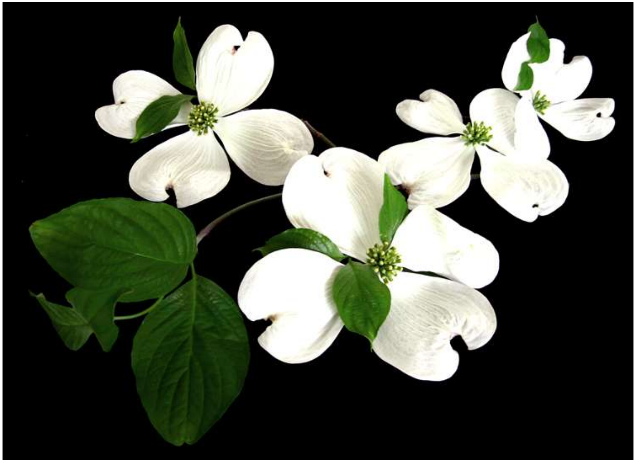
Dogwood, Nature Cove Condominium