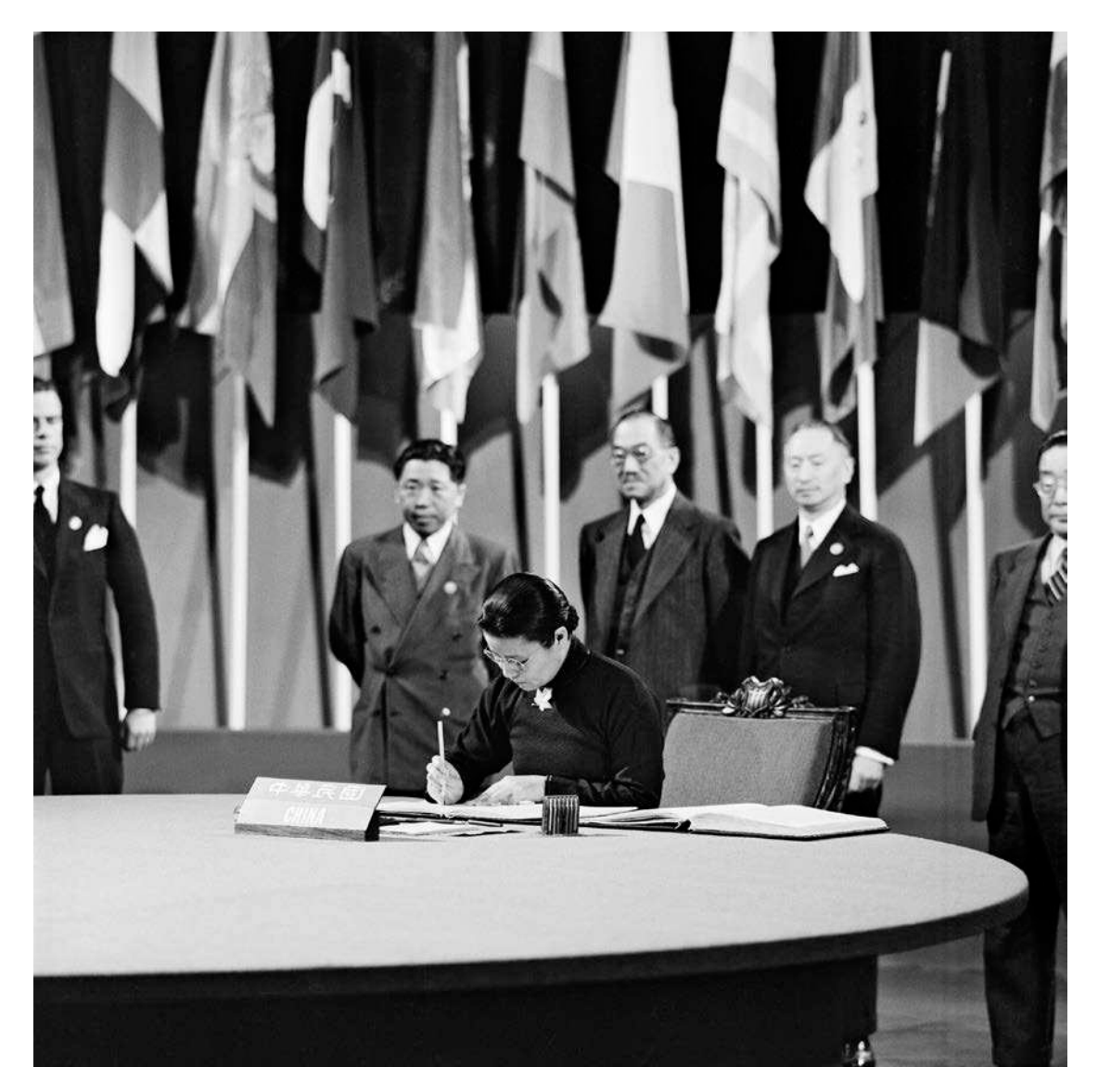
Photo 6 . Dr. Wu Yi-fang signs the United Nations Charter on June 26, 1945 in San Francisco

In her life, there were several firsts: she was among the first five women to receive a bachelor's degree in China; the first woman college president in China; and the only woman in the Chinese delegation to sign the United Nations Charter in San Francisco on June 26, 1945.