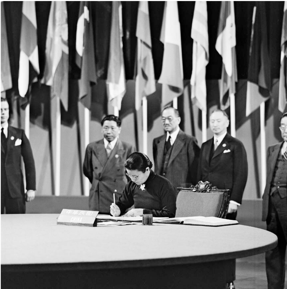
Photo 6. Dr. Wu Yi-fang signs the United Nations Charter on June 26, 1945 in San Francisco

In her life, there were several firsts: she was among the first five women to receive a bachelor's degree in China; the first woman college president in China; and the only woman in the Chinese delegation to sign the United Nations Charter in San Francisco on June 26, 1945.