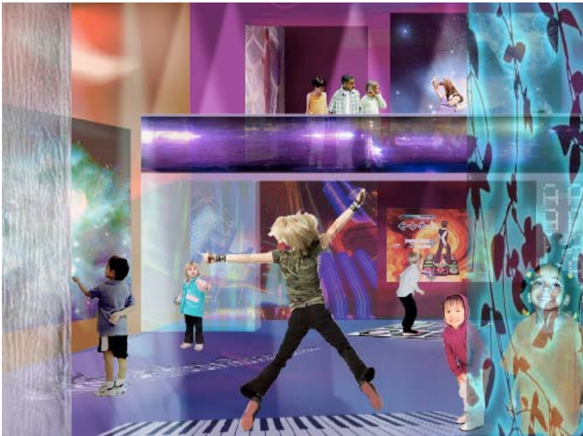
View of proposed Digital Playground