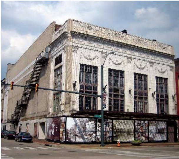
Vacant Paramount Theater in July 2007.

Establish an Arts Incubator on Federal Street in the old Paramount Theater building that will help reinforce this area's strength as a cultural district in downtown Youngstown. Creating work space and gallery space in the building would provide a place for YSU students and community members to mingle. The Arts Incubator can also double as a small movie theater showing independent films in the evenings.