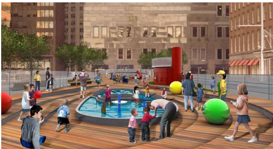
Image of South Street Seaport Playground in Lower Manhattan, NY. Designed by: David Rockwell

Change the police station parking lot into an Adventure Playground located near the Arts Incubator, Digital Playground, Digital Graffiti Alley, and Children's Museum. Adventure Playgrounds are popular in Europe. They consist of elements that children can manipulate and encourage imaginative play. It is a flexible playspace allowing children to engage in developmentally appropriate activities.