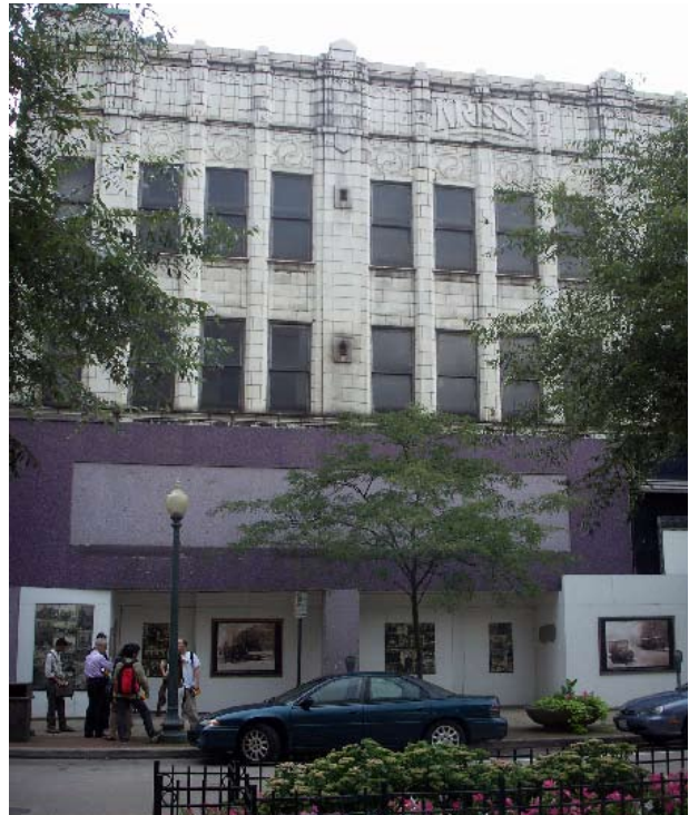
Abandoned Kress Building in July 2007.

Relocate The Children's Museum of the Valley from its current location on Boardman to the Kress Building on Federal Street. Relocating the Children's Museum will be catalytic in clustering 'kid friendly' activity spots together to reinvigorate Federal Street.