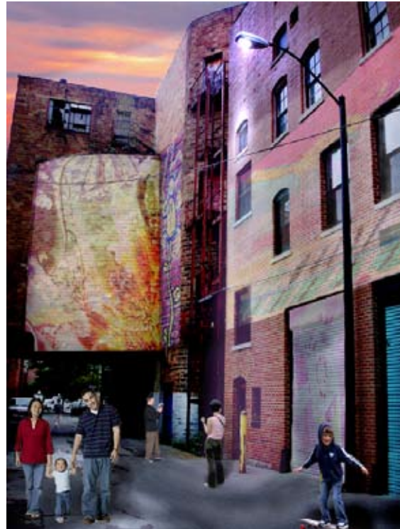
View of proposed Digital Graffiti Alley

Create a Digital Graffiti Alley where children's drawings are projected onto the walls of buildings in the alley. This alley would help link these kid-friendly spaces together.