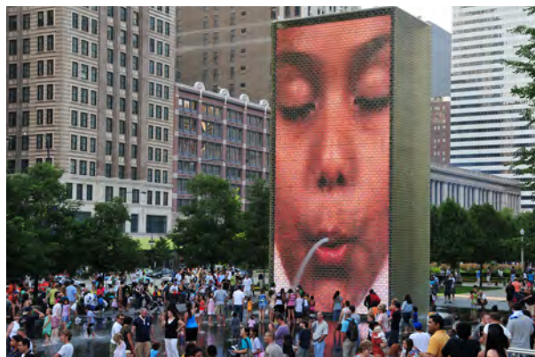
Figure F – View of Jaume Plensa’s Crown Fountain