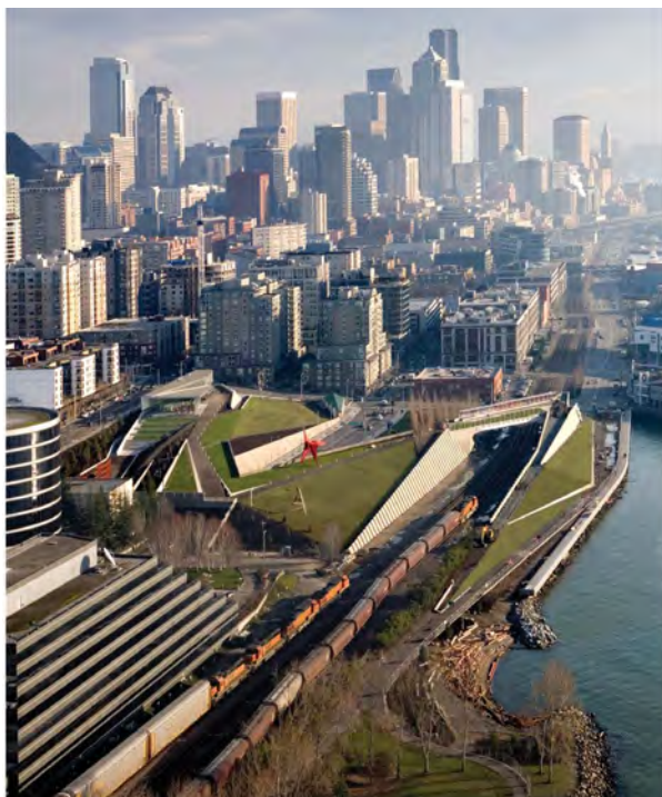
Figure C: Aerial view of Olympic Sculpture Park

At the onset of the 21st century, Chicago and Seattle once again served as prominent settings for innovations surrounding the role and form of contemporary parks. In 2004 and 2007, respectively, Millennium Park opened in Chicago and Olympic Sculpture Park opened in Seattle. Advocates hoped these public parks would remedy center-city blight and serve as catalysts for urban revitalization efforts. In both cases, designers were encouraged to prepare ambitious creative designs to garner national and international recognition.