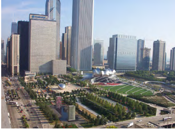
Figure E: Aerial view of Millennium Park demonstrating the numerous options for entertainment

Spectacle Parks greatly exceed those historically found within the Pleasure Ground typology, when size is taken into consideration.