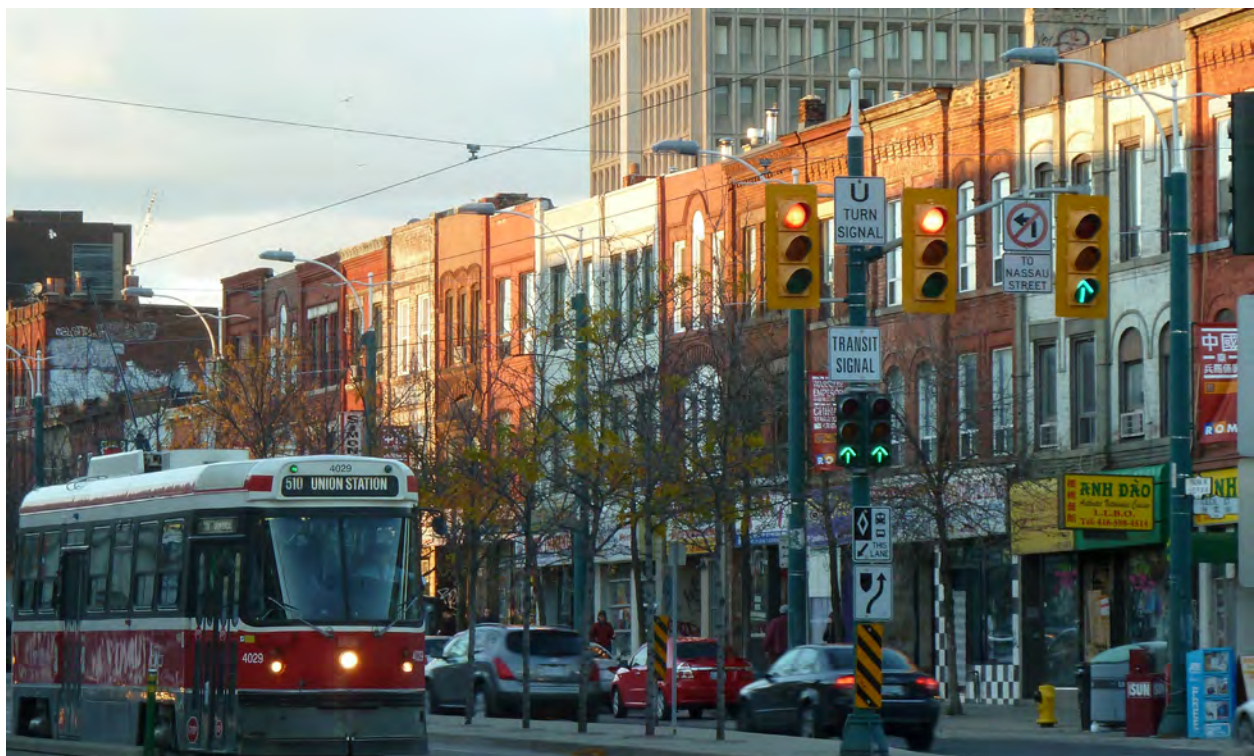
Chinatown, Toronto, Canada.

Not only may light rail projects fail to realize promised benefits of increased mobility, they may also have unintended negative consequences. The development of amenity-rich, transit-oriented developments along the rail corridor increases the potential for gentrification. Because this term has several different meanings, this paper adopts Kenney and Leonard’s (2001) definition of gentrification as “the process by which higher income households displace lower income residents of a neighborhood, changing its essential character and flavor”