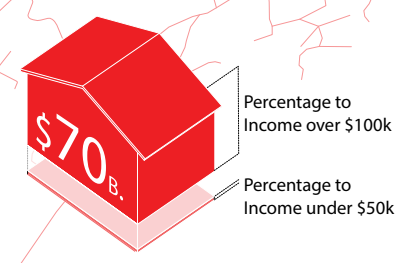
Fig. 7.2: Breakdown of Tax Expenditures on MID in 2012. source: Fisher and Huang, 2013

Prante (2006) believes that four key factors make the MID more valuable for high-income earners than low-income earners. First, as discussed above, taxpayers must itemize to claim the MID, but low-income taxpayers are less likely to itemize. Also, as itemized deductions are proportionate to the taxpayers' tax bracket, the value of itemized deductions rises as income