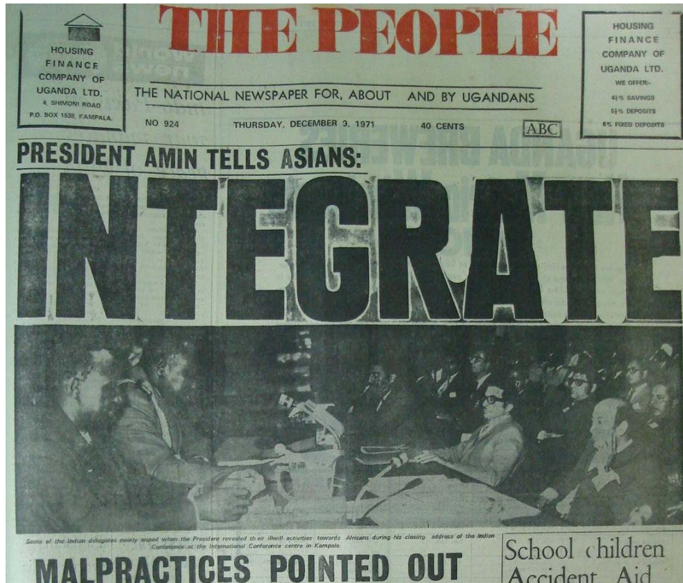
Figure 5.1 Cover of The People , December 9, 1971.

letter he claimed to have received from “an Asian girl, who is married to a Ugandan African.” He departed from his prepared remarks to read this letter aloud to the Asian delegates. It had instructed Amin: “please be very careful while you talk to them because ... in front of people they say they like Africans but when the girl of Indian loves an African they take it very seriously.” 138