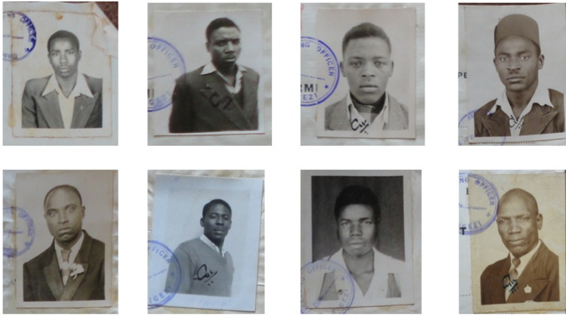
Figure 3.5 Drivers permit photographs, Kabale. 1951-1958. These images were taken by one of two Asian photographers in Kabale. Asian traders in Kigezi controlled the sale of clothing like that worn by the men pictured here. Most applicants were civil servants or employees of Asian trading or mining companies. 155

African traders' dependence on Asian traders and the difficulties of coordinating collective buying groups also reinforced the dominance of Kabale's Asian trading district. In 1953, the District Commissioner lamented the seeming failure of African traders' organizations to break their dependence on Asian retailers by forming collective buying groups. "The Bakiga are essentially individualists. ... the man on the bicycle buying goods at retail rates [from Asian shops] in Kabale remains the rule." 156 One Asian trader remembered that despite only holding a retail license, he acted as a "semi-wholesaler" when "these African people start[ed] little businesses in the jungle." 157 Such patterns of