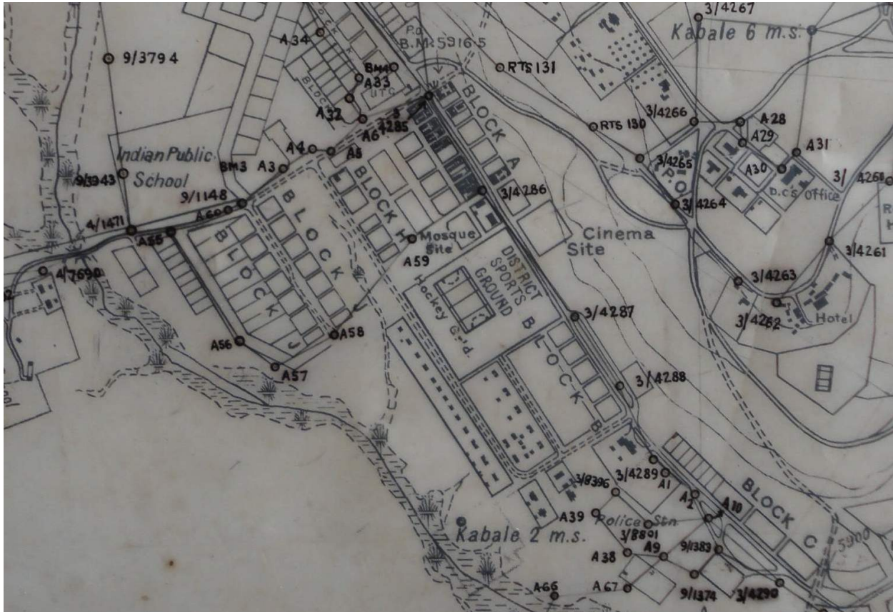
Figure 4.1 Plan of Kabale Town, 1950. Blocks A and B constituted the restricted zone under the 1969 Trade Licensing Act. Block C was the African trading area. Block J was the Asian residential neighborhood, popularly known as Kargote. The “Cinema Site” remained undeveloped until the construction of Town Council offices in 1974. For more on the spatial arrangements of Kabale, see Chapter 3.

The Act’s implementation required district and town council officials to match the legal categories of the law, and the racial categories used by the politicians who supported it, with individual traders in their administrative domains. In July 1969, Kigezi officials received instructions from the Minister of Commerce and Industry, William Kalema, to identify the citizenship status of all traders operating along “Main Street from Kirigime Road junction to the eastern end of the street” and to revoke the trading licenses of non-