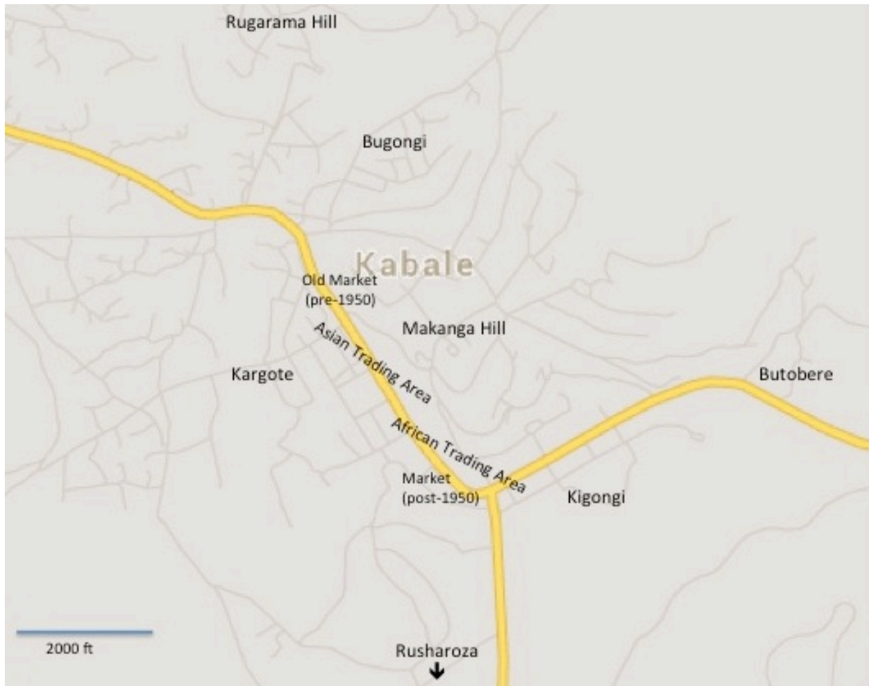
Figure 3.1 Areas of Kabale town.

which Protectorate government headquarters were first built in 1913 to be followed by elite residences, a golf course, and a post office. Two areas at the bottom of the hill became the initial hubs of the town's commercial activity. The first market was located at the western edge of town, while the Asian trading area expanded at the base of Makanga Hill along the main road that connected eastward to Mbarara and westward to Kisoro [see Figure 3.1]. Moving away from the hill, the first road parallel to Main Street would eventually become a center for buses and mechanics' shops. Further away, there developed an Asian residential area, Kargote [see Figure 3.1 and 3.2].