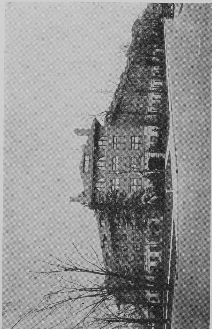
WEST ENGINEERING BUILDING