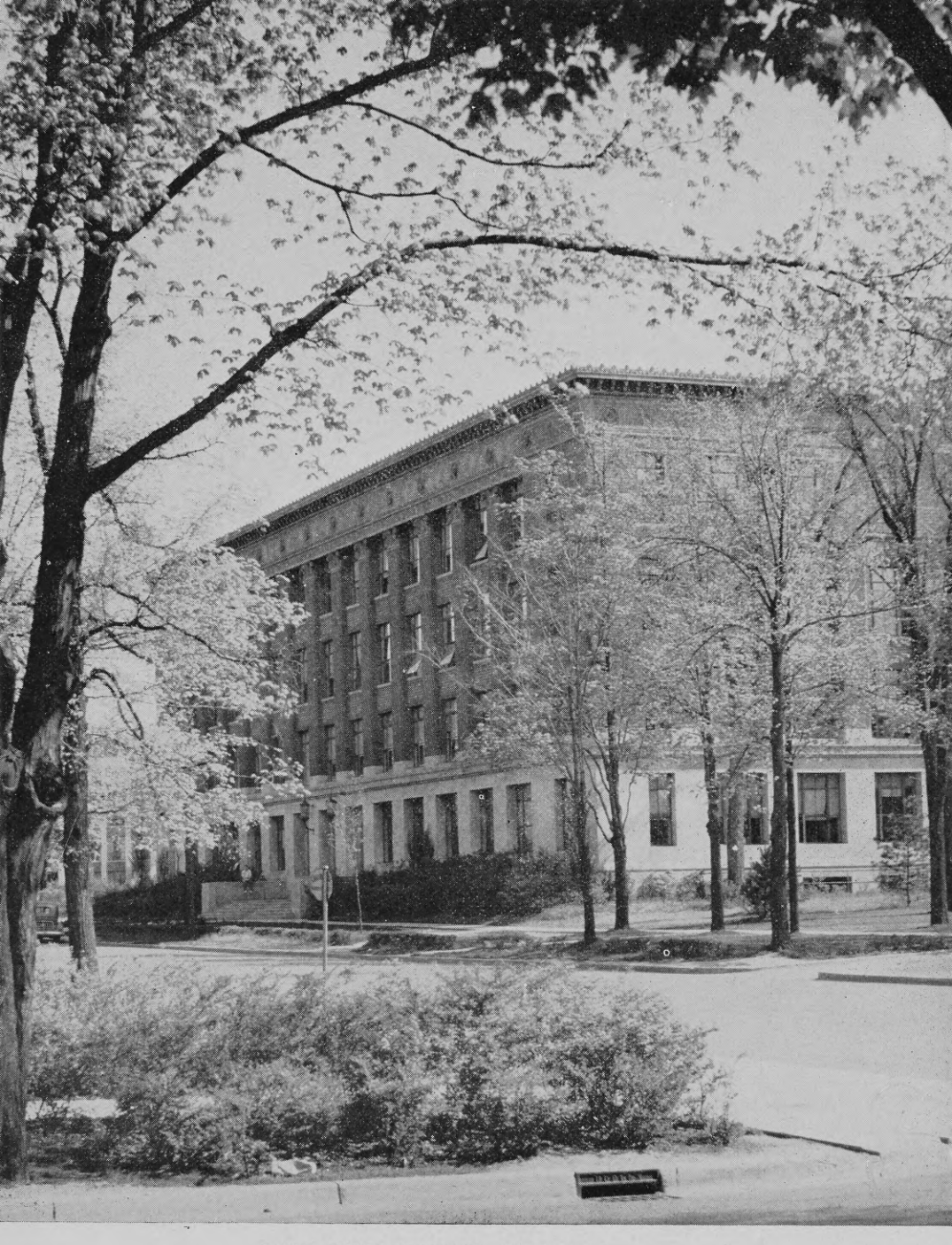
EAST ENGINEERING BUILDING