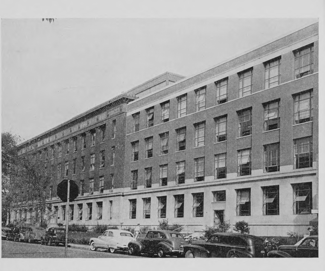
East Engineering Building