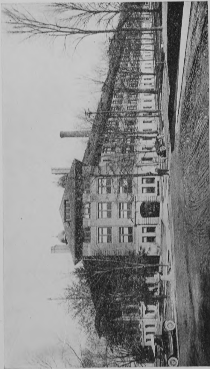
WEST ENGINEERING BUILDING