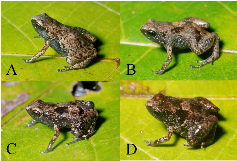
Figure 2. Portraits in life of (A) holotype UMMZ 242417, (B) paratype UMMZ 242414, (C) paratype UMMZ 242415, and (D) paratype UMMZ 242416 of Paedophryne titan .