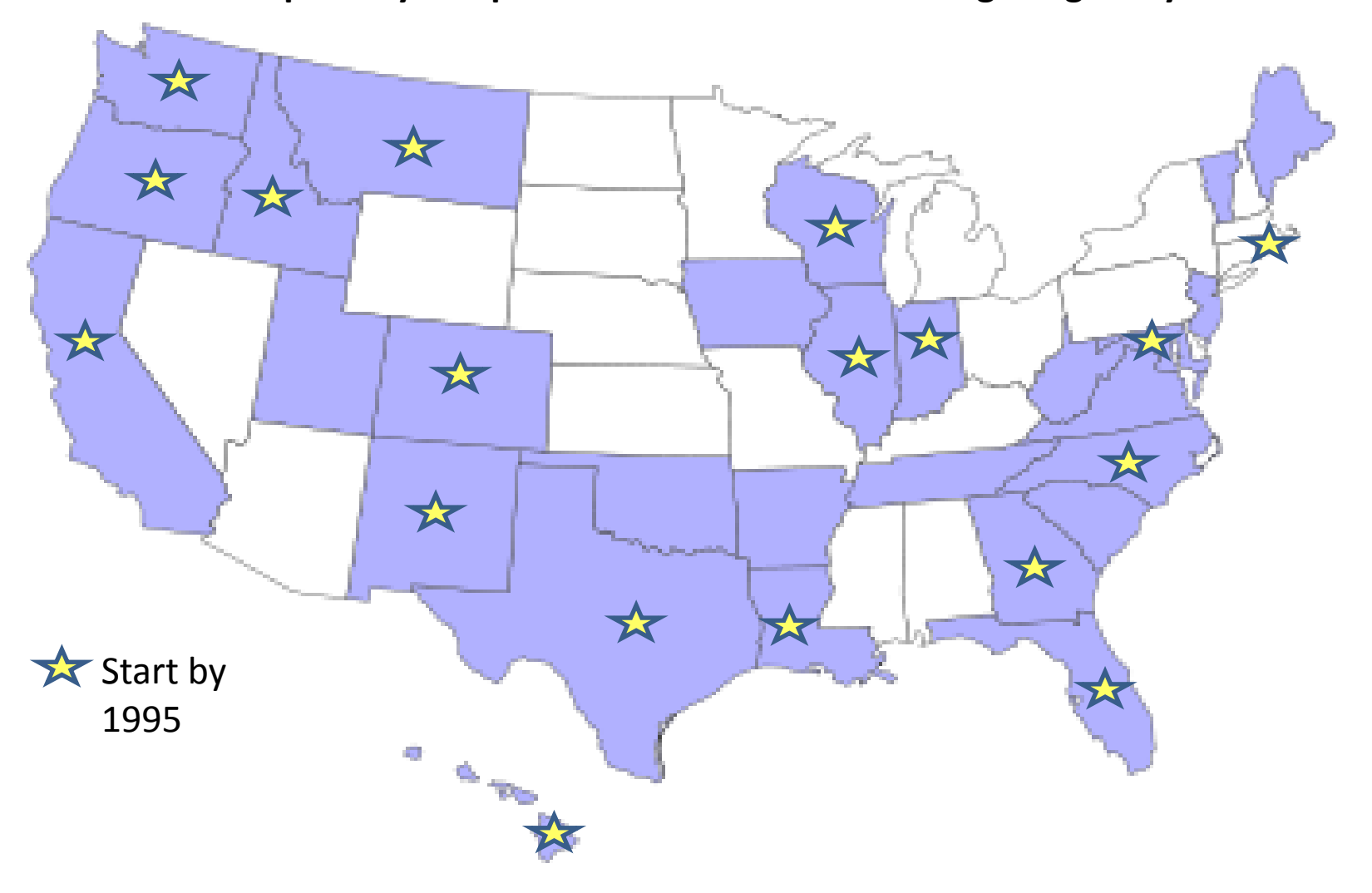
Figure 1: LEHD state coverage Stars indicate primary sample of 18 states whose coverage begins by 1995

Notes: The figure indicates with shading the states that are covered by the LEHD. Alaska is not covered. Stars indicate the 18 states whose coverage begins by 1995 that constitute our primary sample. Coverage for all states ends in 2008.