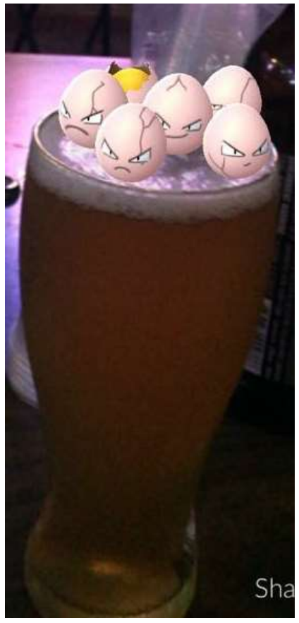
Figure 2. Picture of ExEggCute Pokémon as extra foam on a mug of beer.