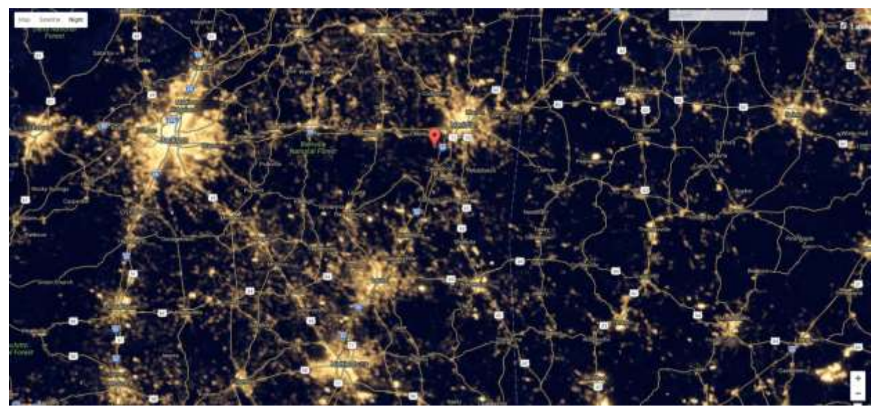
Figure 4 . A closer look. The triangle of space among Meridian, Hattiesburg, and Jackson, MS. Plenty of dark space along the corridor between Jackson and Meridian (the red pin of Stuckey's bridge is in the top right corner of a roughly equilateral triangle).

Or, in the words of Mozart, will the sun's rays drive out the night---in both the real world of a darkened rural Mississippi bridge over the Chunky River as well as in a broader context where enlightenment defeats ignorance?