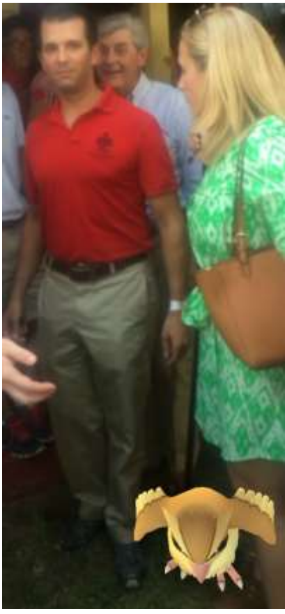
Figure 1. Picture of Pidgey Pokémon, Neshoba County Fair, Mississippi.

In the augmented reality of Pokéman Go, one can place a "Pidgey" in a photograph with a public figure (Figure 1). Or, place an "ExEggCute" as extra foam on a mug of beer (Figure 2). The 'real' and the 'imaginary' come together in an 'augmented' world that mixes parts of the 'real' with parts of the not-so-real—typically by superimposing digital images on real-world scenes.