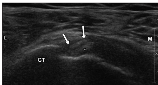
Figure 2. Transverse sonogram showing the accessory head of the biceps brachii from another patient, identified as a hyperechoic fibrillar structure (arrows) located superficial and parallel to the long head of the biceps tendon (asterisk) in the bicipital groove. Abbreviations are as in Figure 1.

Knowledge of the accessory head of the biceps brachii and its appearance on sonography is important to avoid misdiagnosis of disorders. The accessory head of the biceps brachii has a characteristic appearance on sonography and should not be mistaken for a longitudinal split of the proximal aspect of the long head of the biceps brachii tendon.