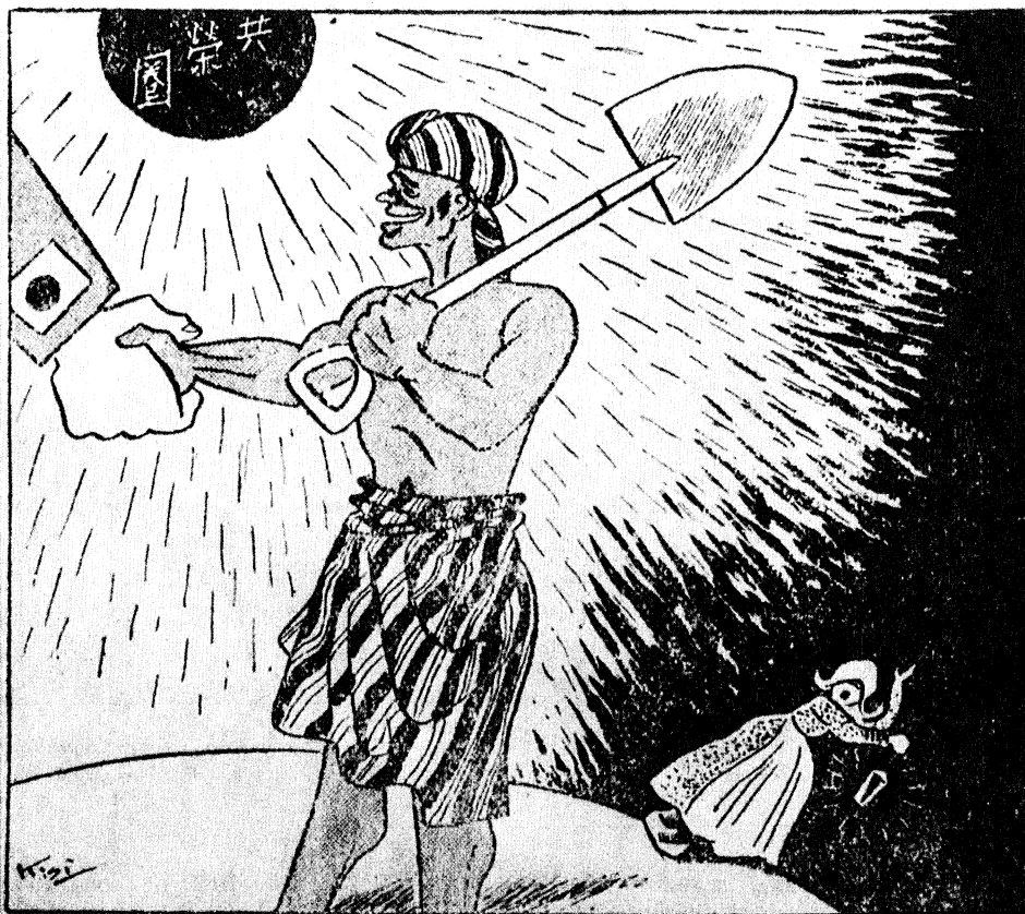
Figure 2. "Person of the Southern Region." This cartoon appeared in Osaka Puck in December 1942 as part of a before-and-after sequence depicting Asia under Western domination and after Japanese liberation. It reveals many of the ways the Japanese signified their superiority vis-à-vis other Asians. Here the familiar purifying sun (labeled "Co-Prosperity Sphere") beams down on Indonesia, driving out the Dutch, while the Japanese hand—symbolizing a larger-than-life patriarch—clasps the native's. The Japanese hand is far lighter in color than the dark-skinned native's, and a modern (Western) jacket cuff is evident, whereas the "southern person," obviously a manual laborer, is half-naked and implicitly half-civilized. His inferior "proper place" as a race, nation, and culture is absolutely clear, as is his subordinate role in the division of labor within the Greater East Asia Co-Prosperity Sphere (adapted from Dower 1986:200). The Netherlands is personified disparagingly as a woman in the archetype of traditional Dutch attire, including wooden clogs, holding a lantern whose light is nearly extinguished by the advance of Japan into the former Dutch colony. Whereas the subjugated Indonesians are reduced to the image of a sarong-clad laborer, the Dutch, an enemy of equal status and power, are feminized in the zero-sum game of sex/gender polarity exaggerated in military-imperial ideology.

impulse that gained momentum in 1919, when, under the Versailles Peace Treaty, Japan gained the Micronesian islands formerly held by Germany (see Peattie 1988).