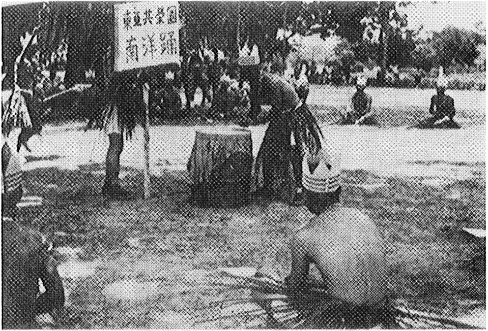
Figure 3. A newspaper photograph published in 1943 of a group of Japanese soldiers in Burma performing the “East Asia Co-Prospersity Sphere South Seas Dance.”

erotically reappropriated as male-to-male sexual play (see Maruki 1930 on homosexual practices among Japanese soldiers).