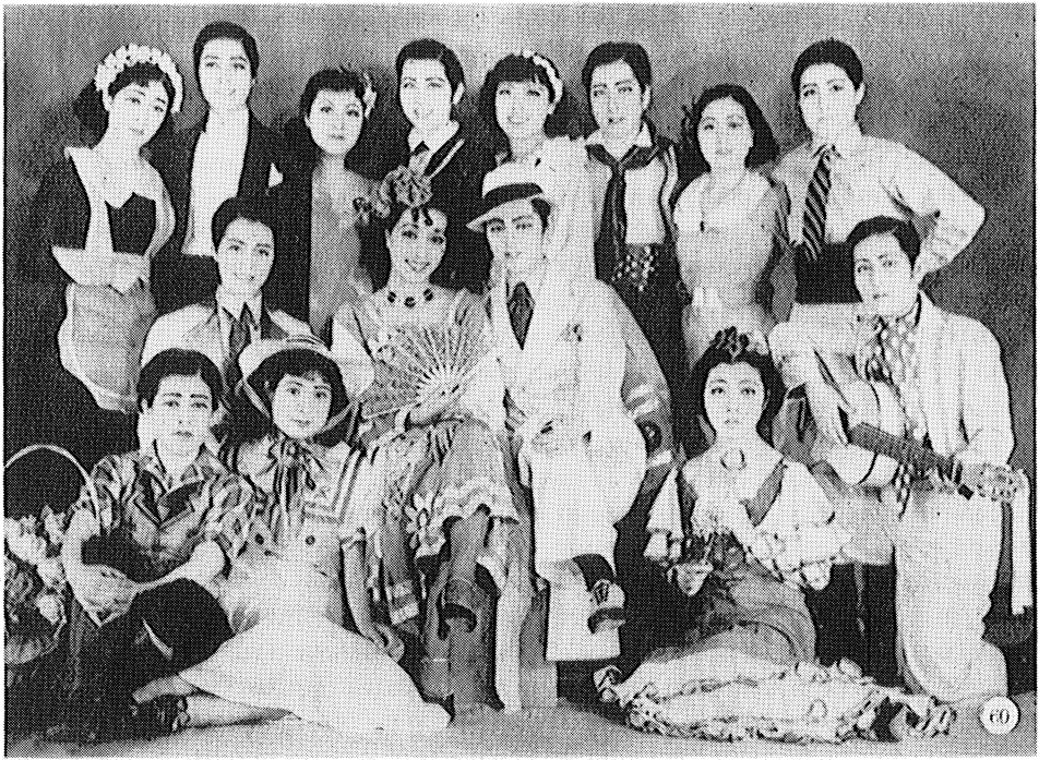
Figure 1. The Takarazuka Revue. A scene from the 1936 revue Rosarita ( Rosarita ).

“them.” In addition to “doing” a wide range of men and women, the Takarazuka actors also embody and perform non-Japanese characters of diverse national and ethnic backgrounds. One aspect of the revue’s erotic allure that paralleled the colonial project was the process of locating and containing the gendered or ethnically marked other within, and thereby assimilating it—but sometimes purging parts of it, as we shall see (cf. Bhabha 1983; Gilman 1985:14–35; Pease 1991; Pickering 1991; Renov 1991).