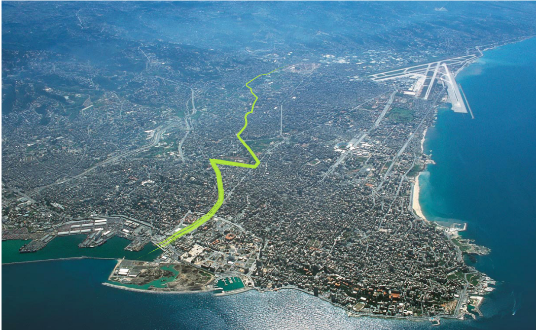
Figure 7 Aerial view of the Green Line.

and its lethal dangers, the once-busy corridor was abandoned by its users, resulting in overgrown stretches. Damascus Road extends south from the city's port in its downtown to the overlaying hills in its suburbs. The Green Line became infamous for its sniper nests occupying the overlooking abandoned and damaged buildings. Roadblocks, encampments, and barricades limited access to a few checkpoints at main axes, allowing civilians to pass through during the occasional cease fires. A couple of blocks from the demarcation line, urban life continued as close to "normal" as possible in a war-torn city.