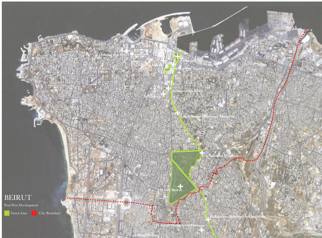
Figure 6 Sites located along the Green Line, Beirut.

destruction of the Berlin Wall, such that by 1990 only a small portion remained for the intention of establishing a memorial. While the initial reaction to traumatic events was the gut rejection of any physical reminders of the haunting past, Tumarkin states in her book Traumascapes , “After the rage many Berliners felt towards the Wall quietened down, questions began to emerge. Was the near total-destruction of the Wall, though understandable, still a serious mistake?” 15