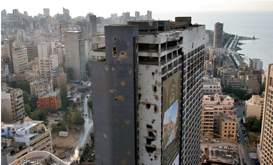
Figure 3 View of “The Holiday Inn” in Beirut.

discovery of several historical layers, including the site of the “Rivoli” building at the southern edge of Martyrs’ Square—a historical square in the center of Beirut that sits on the Green Line. Revealing these centuries-old ruins returned them to the urban fabric of modern Beirut and incorporated them into the daily routines of its citizens.