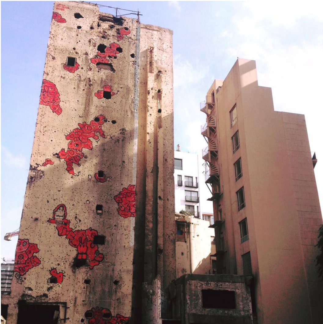
Figure 2 Example of Jad el-Khoury's War Peace on the facade of a damaged building

In another example in Belgrade, government officials preserved a bombed-out structure for the intentionality of retaining a physical reminder of the bombing by NATO forces. The act of preserving artifacts of the War in the built environment took an inherently political stance towards acknowledging the destruction. Thus, reconstructing Ajami Square was inherently political as the space iconically represented the city, and needed to illustrate the possibility for the