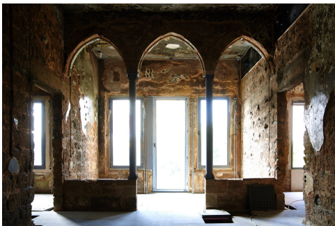
Figure 1 Inside the Beit Beirut Museum.

the tragedy while promoting a “getting back to normal” mentality. The final, less likely outcome Woods describes takes an active stance toward acknowledging the trauma by stating “the post-war city must create the new from the damaged old.” 6