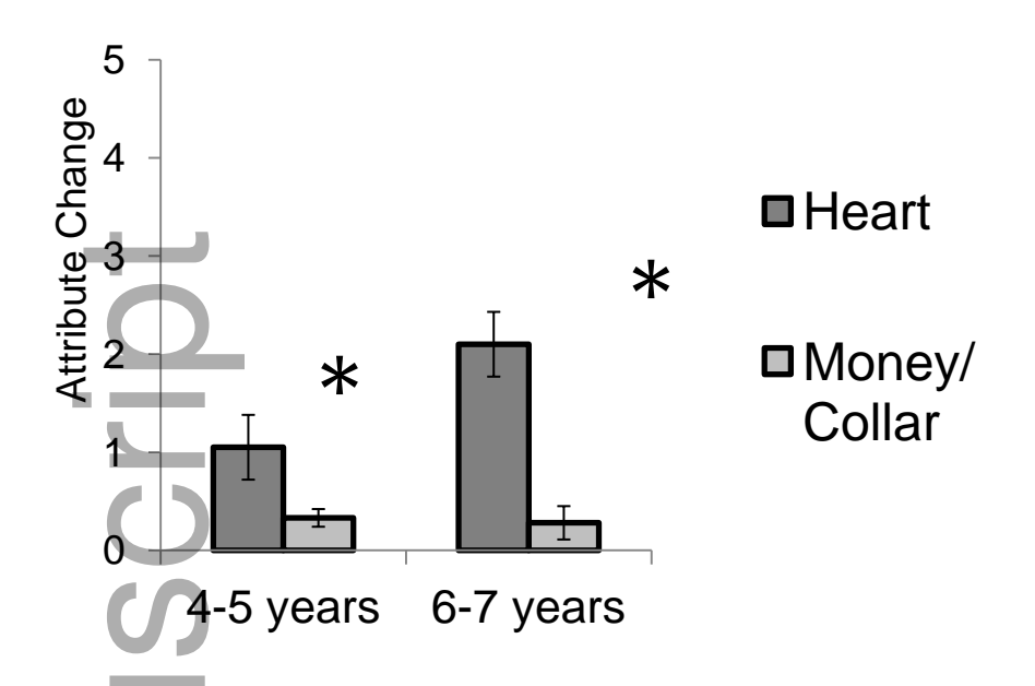
Figure 2. Mean endorsement of attribute change for Heart and Money/Collar conditions,

Study 2. Error bars represent \pm 1 standard error of the mean.