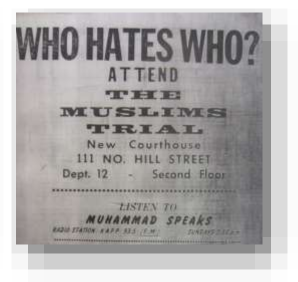
Figures 2-3: Flyers advertising the Stokes trial

Other flyers, such as one advertising a mass unity rally sponsored by "all local organizations concerned with human rights" drew explicit connections between the brutality in Birmingham and Los Angeles. It urged people to protest the "Terror in Birmingham" and "Police Brutality in Los Angeles" while unifying for the common goal of freedom and justice. <sup>157</sup>