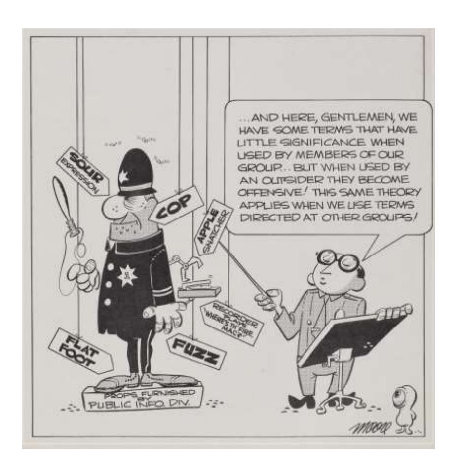
Figure 1: Cartoon, Daily Training Bulletin, Los Angeles Police Department, October 22, 1962.