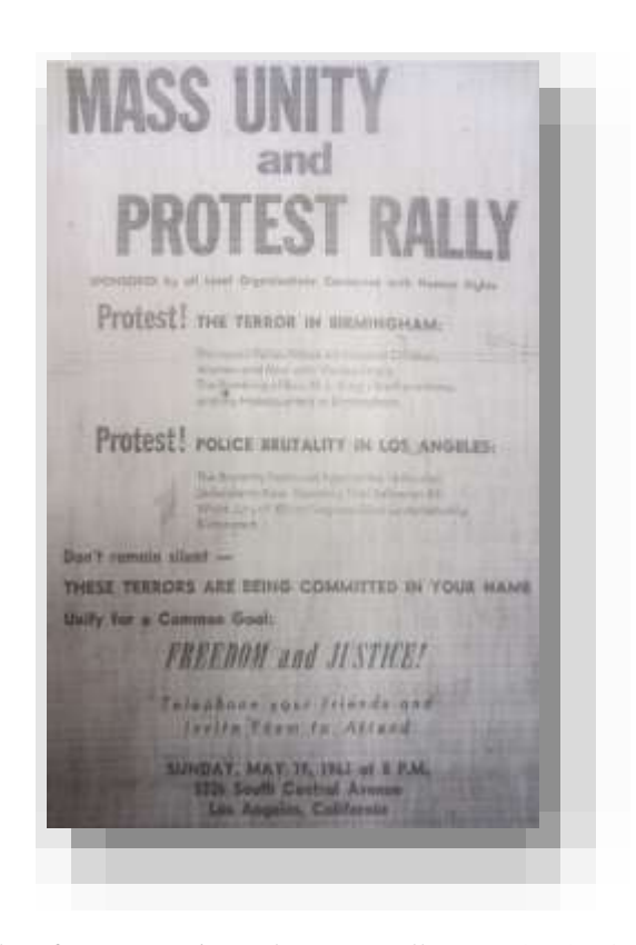
Figure 4: Flyer for Mass Unity and Protest Rally, May 19, 1963

In Muhammad Speaks , a subscription flyer put Los Angeles in conversation with the southern civil rights movement and African decolonization. Calling the new newspaper the " third dimension " in national and international news, the advertisement recognized that "people want to know more than what happened in Greenwood, Miss., or Angola, S.W. Africa, or Los Angeles" (emphasis in original). Flyers publicizing the trial and protest rallies transformed the Stokes trial into a stage to bring together these different regional acts – the southern wing of the civil rights movement, Third World anticolonial struggles, and the struggle against police brutality outside the South – of a larger global play. 159