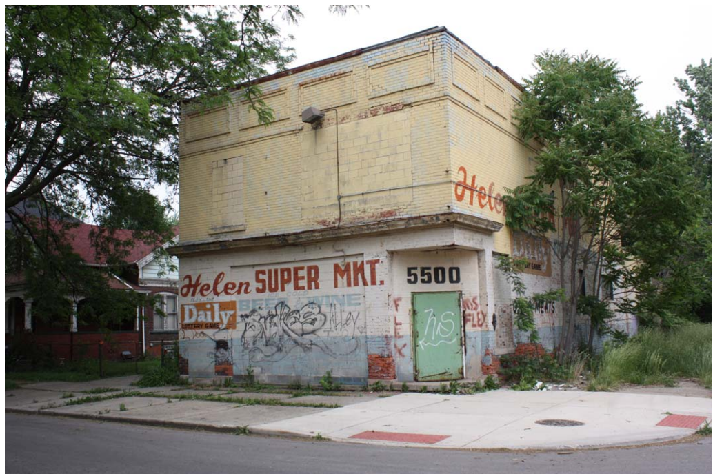
Figure 2. Abandoned store.