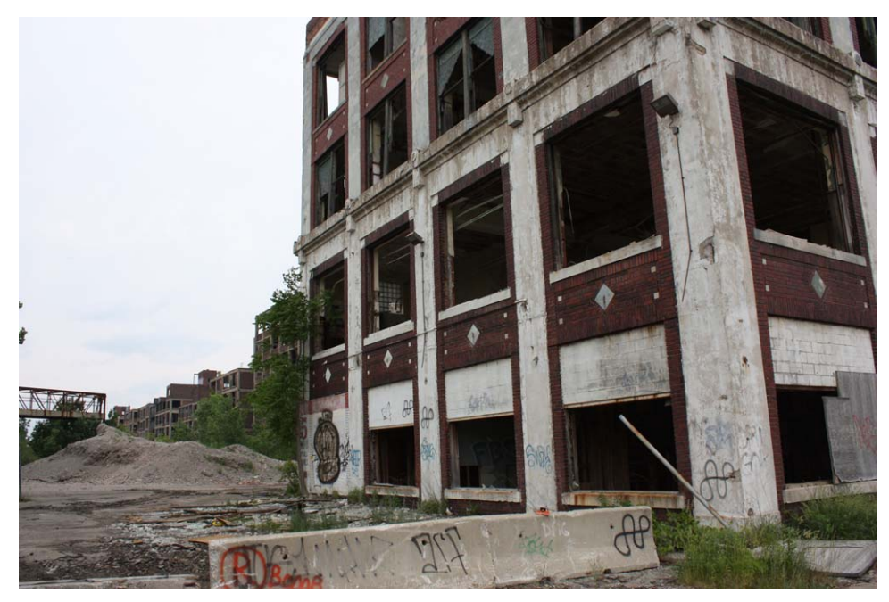
Figure 3. Abandoned factory.