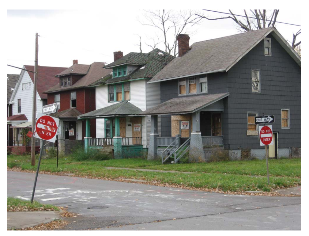
Figure 4. Neighbourhood blocks consist of extensive housing abandonment.