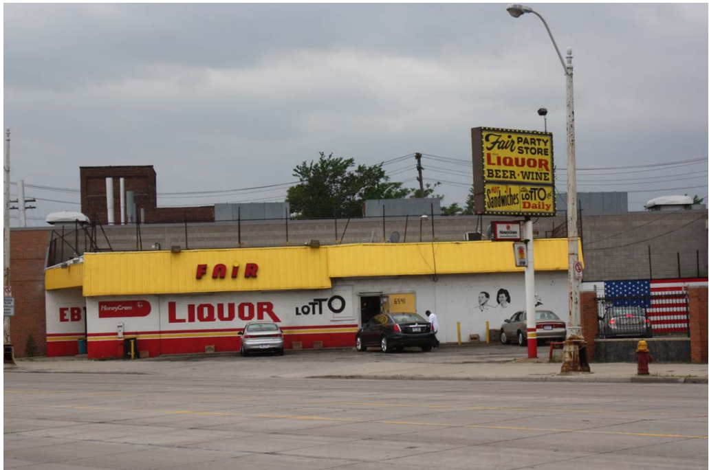
Figure 5. Liquor and party stores dominate the local retail landscape.

their physical ability. Walking, whether as a leisure or destination activity, is considered the most frequently engaged in physical activity among a wide spectrum of the population. Walking is accessible and considered acceptable even among subgroups who generally engage in limited physical activity, including the elderly and minority populations (Booth et al. 1997; Giles-Corti & Donovan 2002). However, past research has shown that health benefits from older neighbourhood built environments that promote walking have been offset by severe urban decline and poverty (Zick et al. 2009; Vojnovic et al. 2013, 2014).