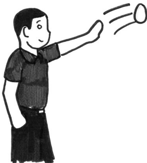
Figure 1. Sample illustration from the training session (Set 1), accompanying the sentence The man throws the egg .

During the second session, 2 to 7 days after the first, participants began with a vocabulary review. They heard a word in the foreign language and saw four illustrations on the screen. They had to choose