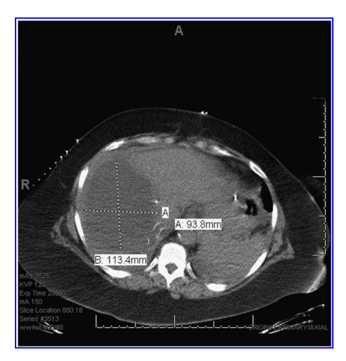
FIG. 1. Computed tomography shows a large fluid collection in the right upper quadrant with no evidence of intrahepatic biliary dilatation.

no evidence of intrahepatic biliary dilatation (Fig. 1). The collection was drained with computed tomography—guided percutaneous drainage on postoperative Day 2.