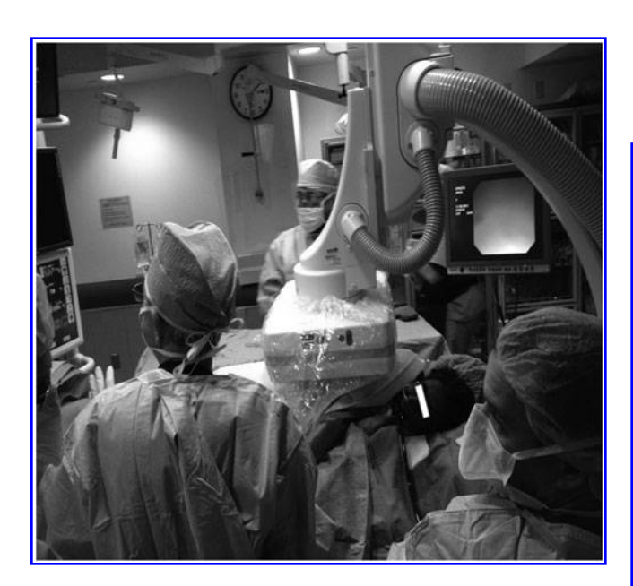
FIG. 2. Interventional radiology suite accommodating both endoscopy and interventional radiology personnel and equipment.

ERCP for biliary stent placement was attempted. A complete disruption of the CBD was demonstrated, and attempts at placing a guidewire into the intrahepatic biliary tree were not successful. Two days later, a percutaneous transhepatic cholangiography (PTC) attempt to place an internal–external biliary catheter was unsuccessful at recannulizing the distal