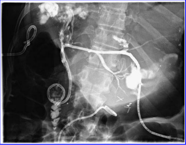
FIG. 4. Internal—external biliary—duodenal catheter achieves biliary continuity.

CBD as well. A left hepatic duct catheter was placed. A segmental resection of the CBD along with its transection rendered it essentially impossible to achieve recontinuity of the biliary tree by placing a guidewire using a single method. A combined rendezvous procedure was then attempted. The procedure was set up in a large interventional radiology suite that accommodated both teams simultaneously (Fig. 2). An ERCP was carried out with a side-viewing duodenoscope, and the ampulla of Vater was cannulated, allowing for the passage of a guidewire up the distal CBD and into the biloma cavity (Fig. 3). Subsequently, PTC was performed though the patient's left-sided biliary branches into the same space. After multiple attempts, the guidewire was snared within the cavity and pulled through the existing PTC catheter outside the