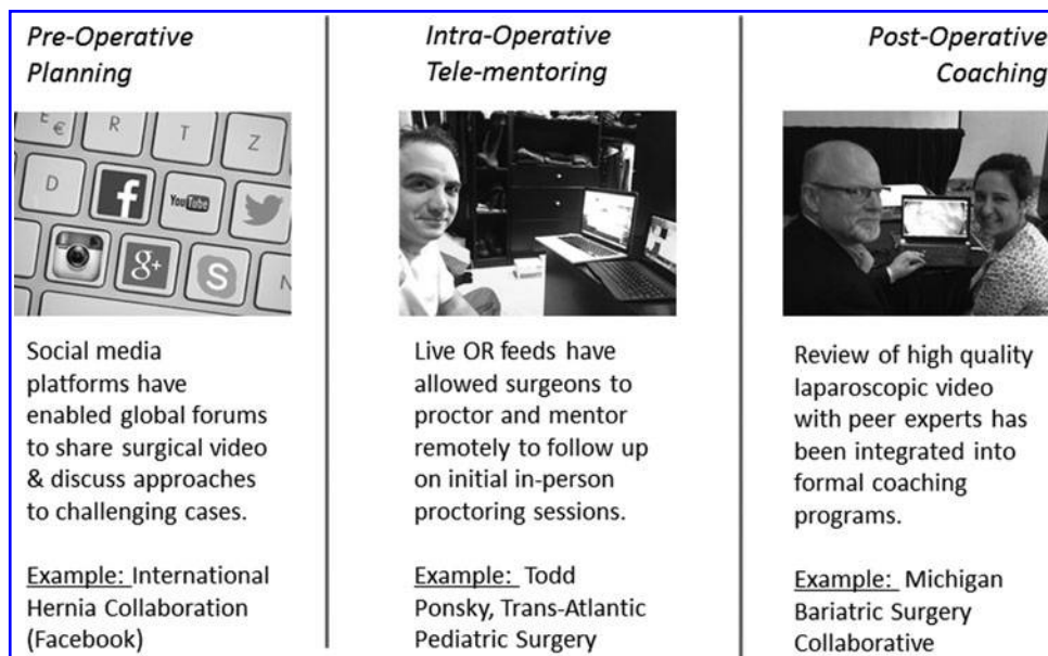
FIG. 2. Novel use of video to improve surgical safety.

Important mentorship gaps are filled by surgical tele-mentoring. Current training models in new procedures often involve observerships or double scrubbing a few operations before performing a procedure independently. Rather than this abrupt transition from trainee to practitioner, telementoring allows for a gradual tapering off of mentor expertise for a safer transition to independent practice. Maintaining operative mentorship as a surgeon develops and refines a new technique should help reduce patient risk during this early portion of the learning curve. Although telementoring has been well described in pediatric surgery, it is also being applied in other specialties, including global, urological, and colorectal surgery. 7-9 Before telementoring can be widely adopted, surgeons will need guidelines to help decide when and how this type of surgical education should be used.