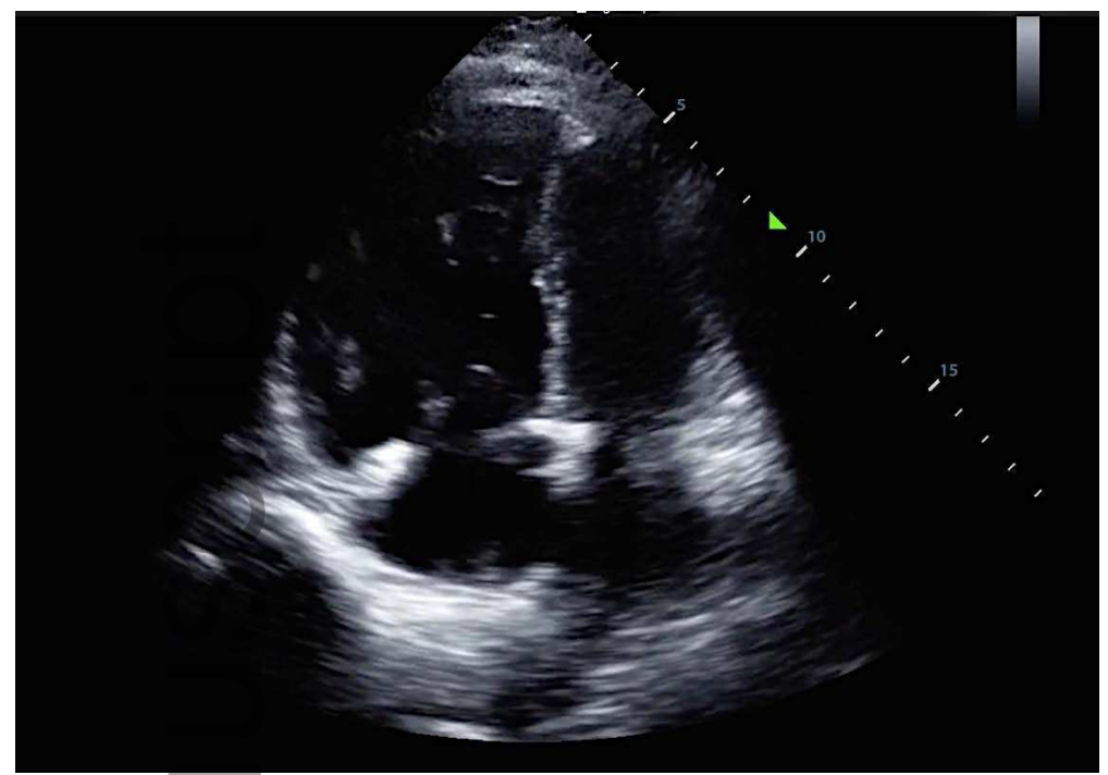
Figure 2: Examples of how ultrasound findings from the CPUS examination were used to help determine a leading diagnosis for patients with undifferentiated shock or respiratory distress.

A) Enlarged right ventricle imaged in apical four-chamber view. When seen with a distended, non-collapsing IVC in a patient with dyspnea, these findings are suggestive of a pulmonary embolism.