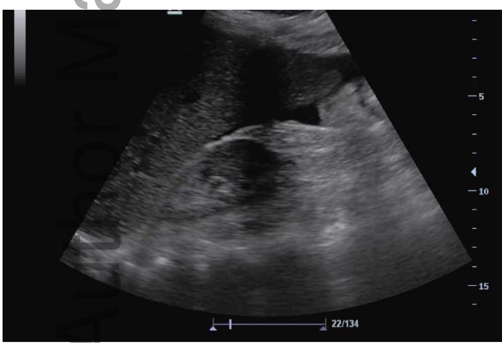
B) Free fluid in right upper quadrant. When seen with a hyperdynamic left ventricle and a flat IVC in a febrile patient with hypotension and abdominal pain, these findings are concerning for a sepsis, such as from typhoid fever.

A) Enlarged right ventricle imaged in apical four-chamber view. When seen with a distended, non-collapsing IVC in a patient with dyspnea, these findings are suggestive of a pulmonary embolism.